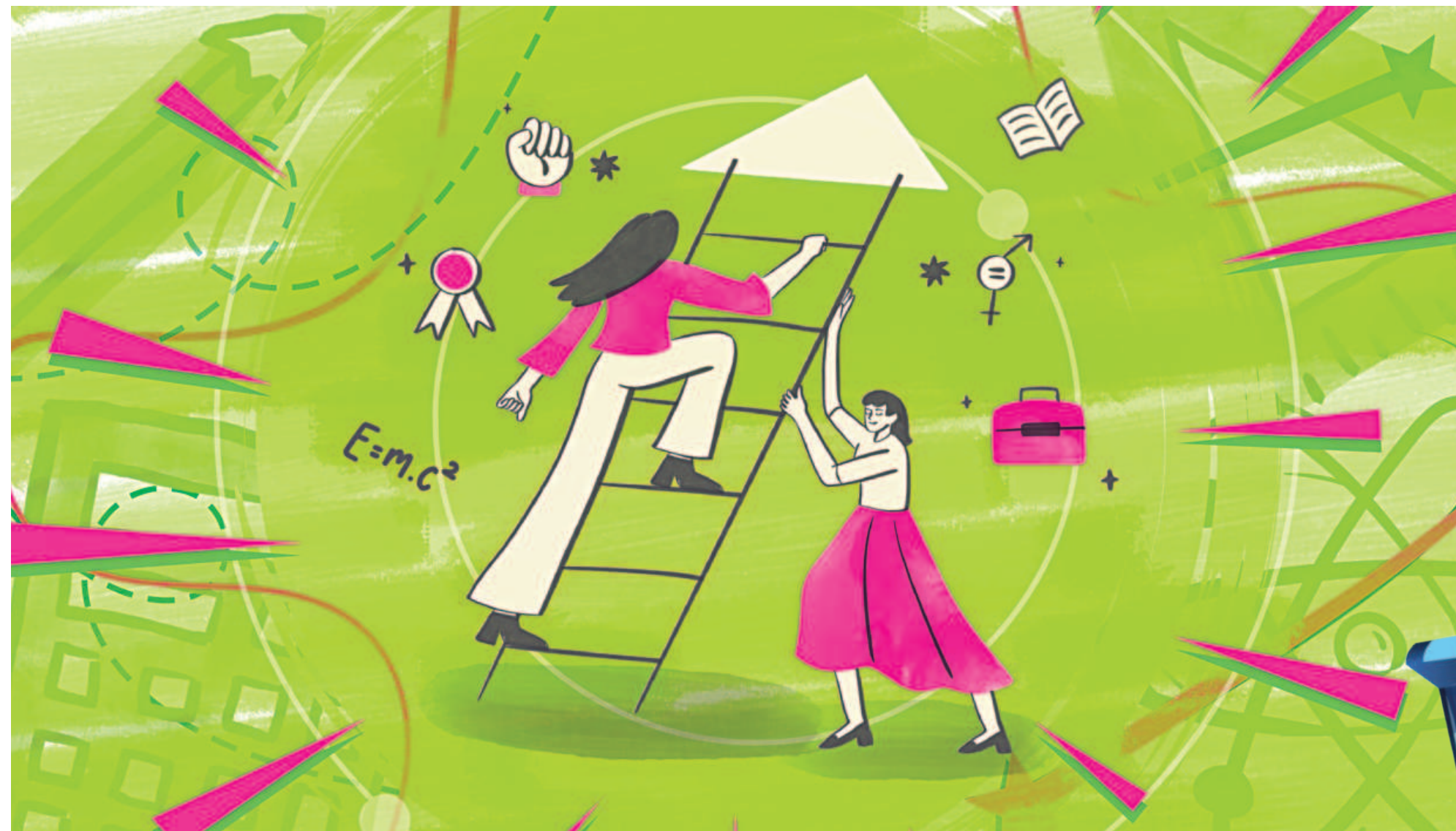
ILLUSTRATION: ABIR HOSSAIN