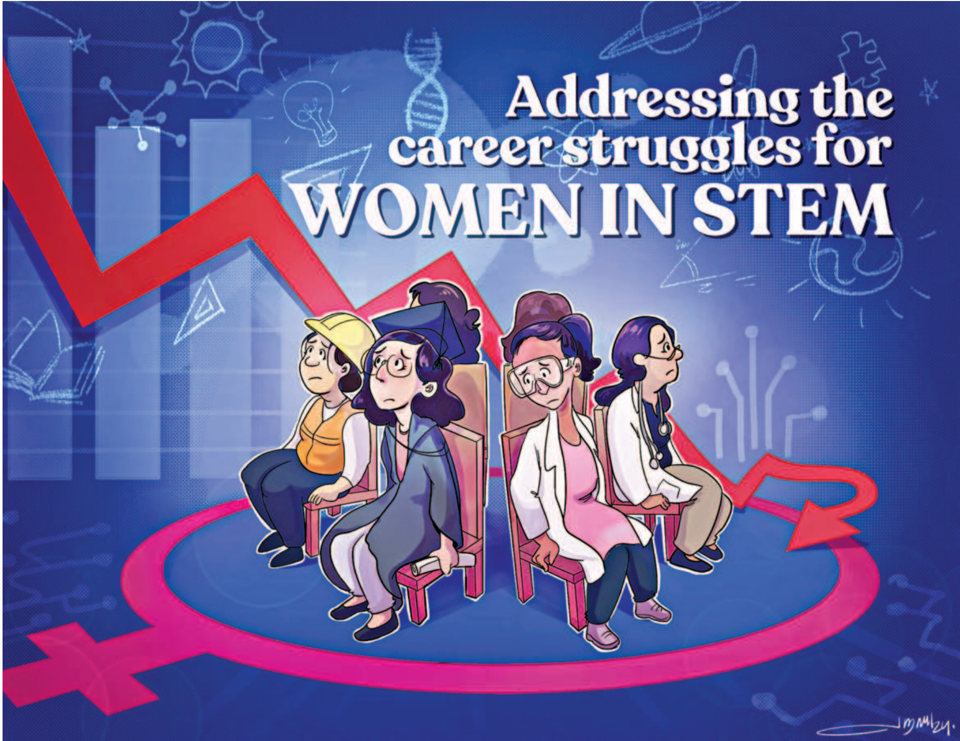
ILLUSTRATION: NATASHA JAHAN