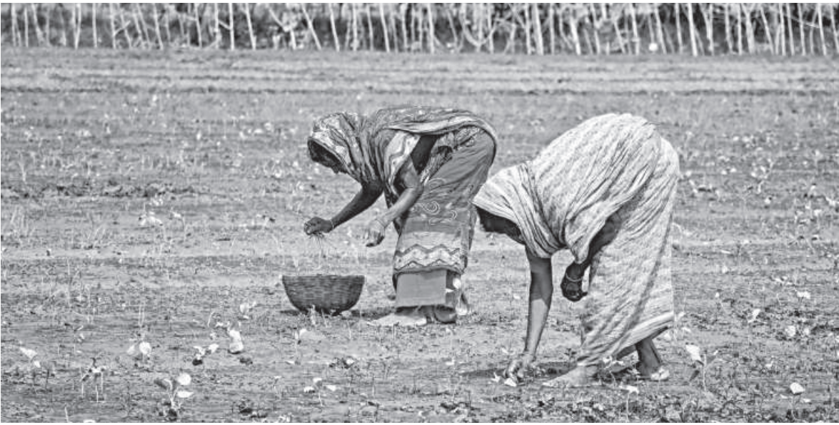
Female labourers clearing weeds from a field in Chuknagar area of Khulna yesterday. Once cleared, farmers will plant various winter vegetables like cauliflowers and cabbages here. After working from the morning till noon, these women are paid Tk 250 per day.