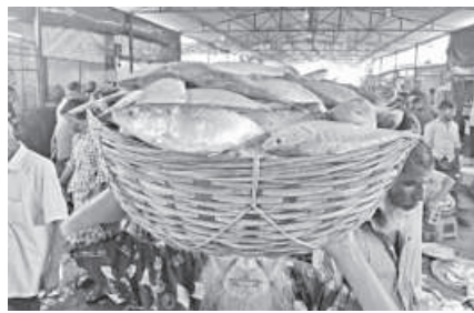
spotted in Barishal's Port Road wholesale market. Locals said many of these fish were discoloured and appeared frozen, indicating they may have been caught

Just six hours after the restriction was lifted, at least 500 maunds of hilsa were