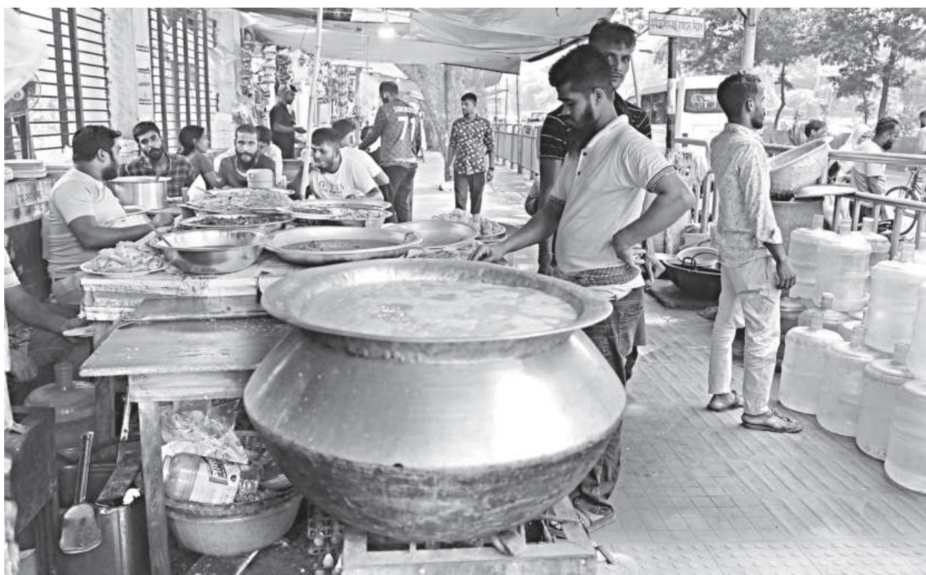
A makeshift roadside eatery occupies a significant portion of the footpath in front of the Shaheed Suhrawardy Medical College Hospital in the capital. With the eatery running its activities, including cooking, there, pedestrians face difficulties and safety concerns while walking on the footpath and are often forced to walk on the road instead. The photo was taken yesterday.