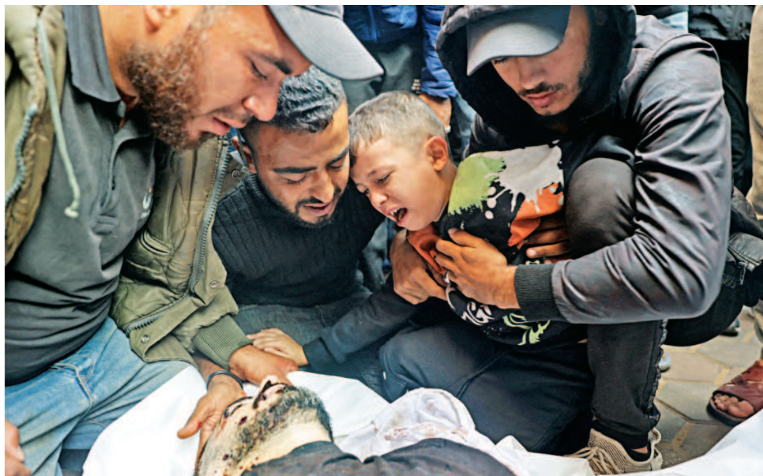
Palestinians mourn near the bodies of their relatives, who were killed during Israeli bombardment, in Deir el-Balah in the central Gaza Strip yesterday.