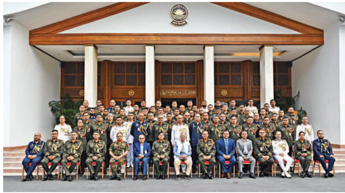
Chief Adviser Prof Muhammad Yunus with the members of NDC and AFWC courses of National Defence College at his office in the capital's Tejgaon yesterday.