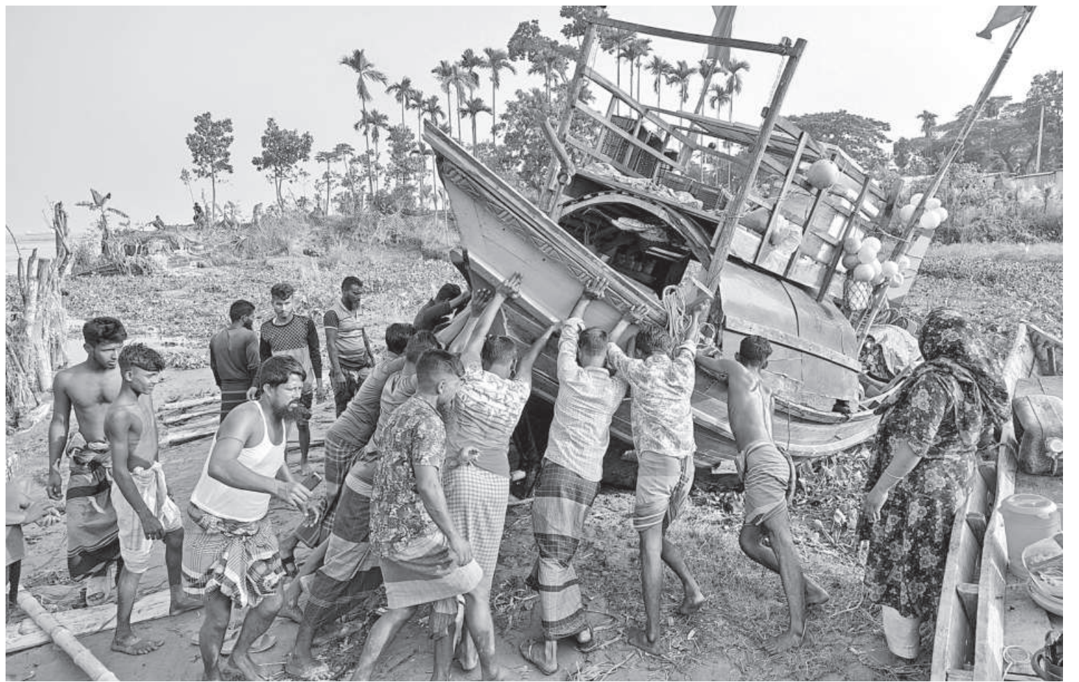
With the 22-day ban on catching hilsa being lifted, thousands of fishermen are busy preparing their nets and boats since yesterday morning. For many, the ban being lifted has left them with a sense of relief, as they were struggling to make ends meet during those 22 days. The photo was taken from Dhania union in Bhola.

A total of 3,19,830 tonnes of rice was distributed among 4.21 lakh registered fishermen in Barishal division during the ban period as assistance under the VGF programme.