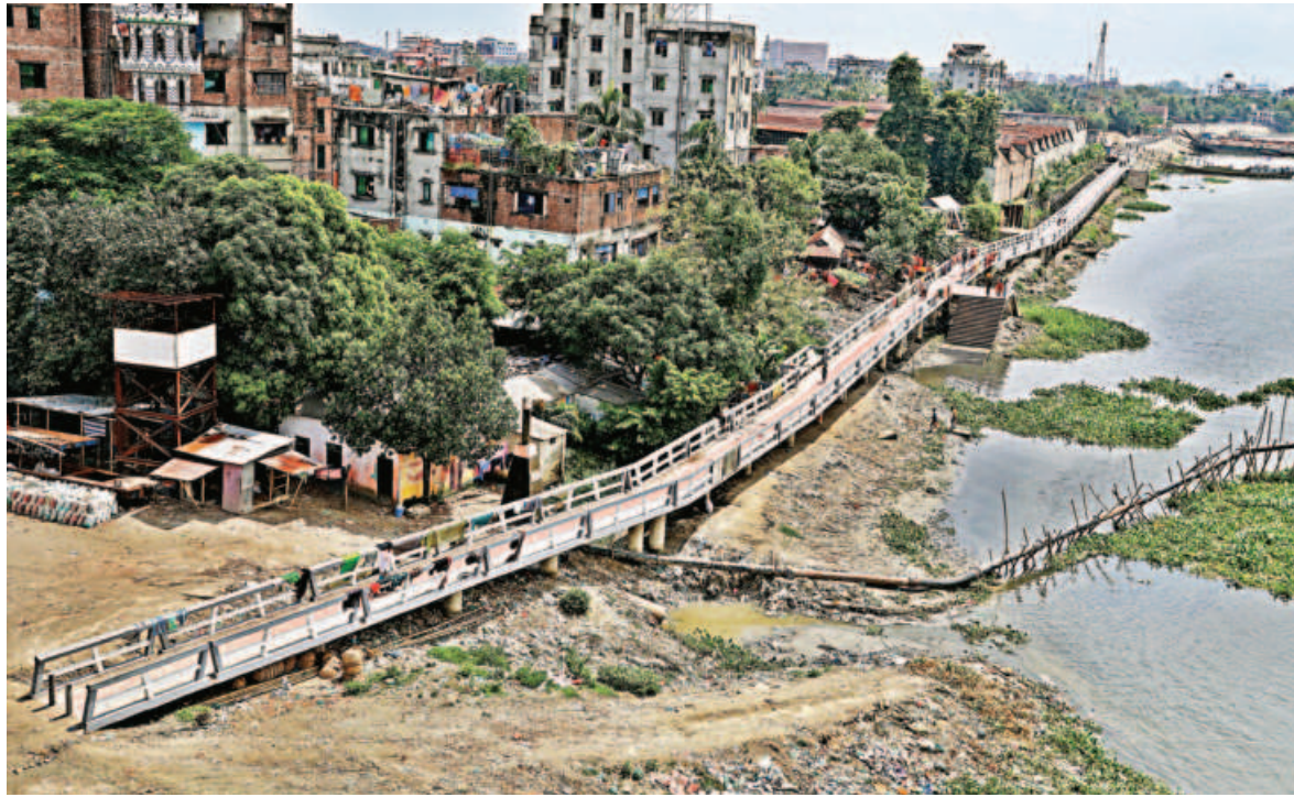
Around a decade ago, illegal establishments built by encroachers lined the banks of the Shitalakkhya. However, a government initiative to build a 52-km walkway on the sides of the Buriganga, Shitalakkhya and Balu rivers has changed the entire outlook of the spot as encroachers are now unable to grab the banks to build any structures. The photo was taken recently.