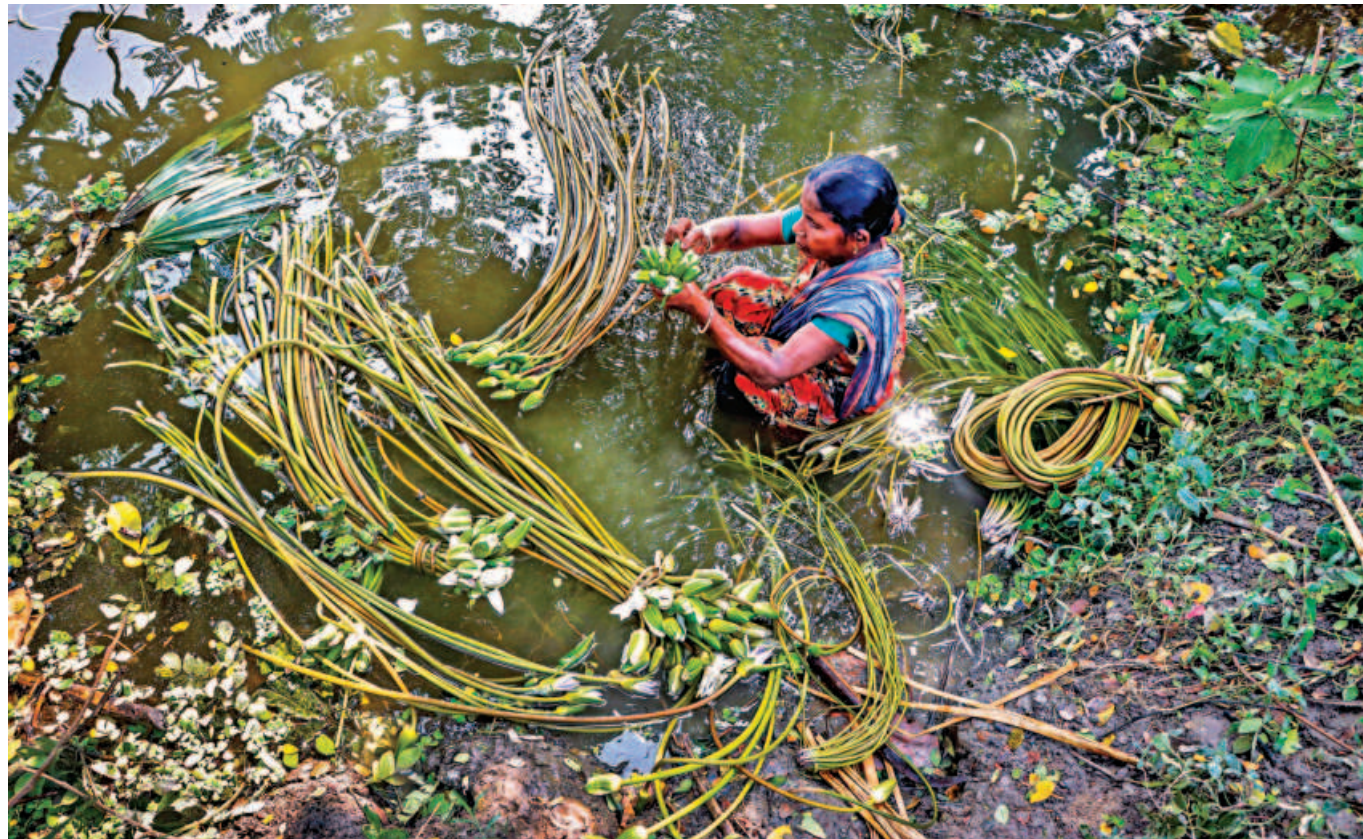
Monsoon brings fortune for Kaushalya Thikadar as the swollen waterbodies in the Dumurtala village of Jashore's Abhaynagar become the perfect hosts for the growth of waterlilies, locally known as shapla – the stems of which are winter delicacy in the country. She collects around 25-30 shapla sticks from different canals and beels every day and sells them at Tk 10 per bundle of seven to 10 sticks. The photo was taken yesterday.