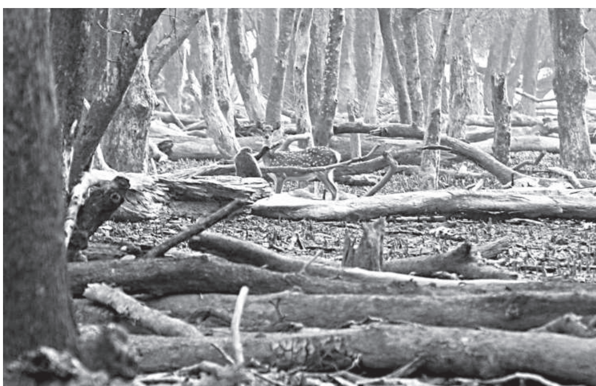
In a densely populated country like Bangladesh, convincing locals to spare land for biodiversity has been challenging.

Improving our relationship with nature is the best way at the moment to address the consequences of climate change. The ecosystems around us, such as forests, wetlands, and mangroves, are natural machines for mitigating climate change. Forests alone absorb about 2.6 billion tonnes of carbon dioxide (CO2) annually, which is one-third of the CO2 released by burning fossil fuels. Besides, mangroves and seagrass meadows can store five to ten times more CO2 per hectare than terrestrial forests. Forest restoration and wetland