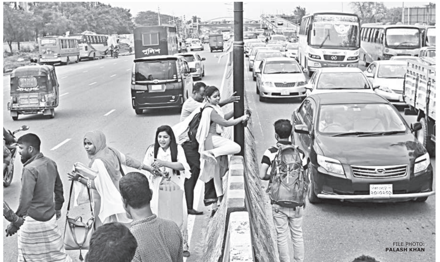
The road traffic fatality rate in Bangladesh is alarmingly high, at 102.1 fatalities per 10,000 vehicles, according to a study.

In Bangladesh, professionals from local road agencies first proposed conventional design interventions at four highway sites known for high pedestrian traffic. Focus group discussions were then held with students and workers—those most at risk while crossing these highways. Following these discussions, four co-design workshops were conducted,