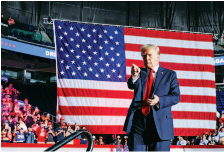
Left, Democratic presidential nominee and US Vice President Kamala Harris applauds during a campaign rally in Charlotte, North Carolina on Saturday. Right, Republican presidential nominee and former US president Donald Trump gestures on the day of a campaign rally in Greensboro, North Carolina, US on Saturday.