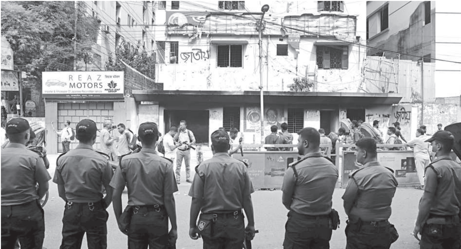
Police personnel stand guard in front of the Jatiyo Party central office in the capital's Kakrail to prevent any untoward situation. On Friday, Dhaka Metropolitan Police announced a ban on all meetings, gatherings, processions, and demonstrations in the area. On Thursday evening, a group of people marching under the banner of "Anti-fascist students, workers, and masses" vandalised and set fire to the ground floor of the five-storey building housing JP's office. The photo was taken yesterday.