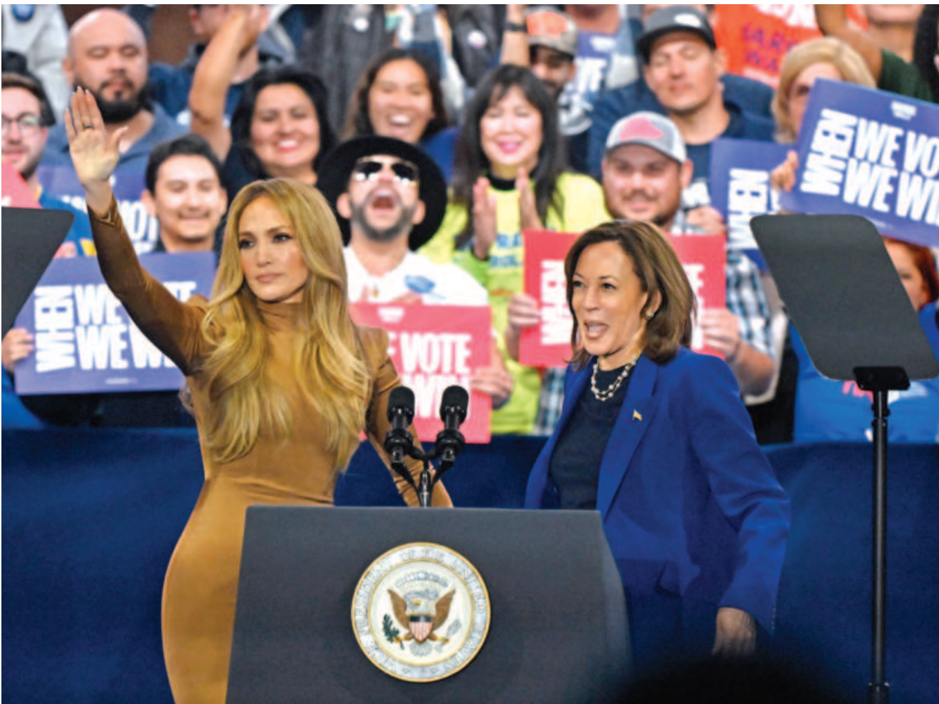
Democratic presidential nominee US Vice President Kamala Harris and US singer Jennifer Lopez attend a campaign rally in North Las Vegas, Nevada, US on Thursday.