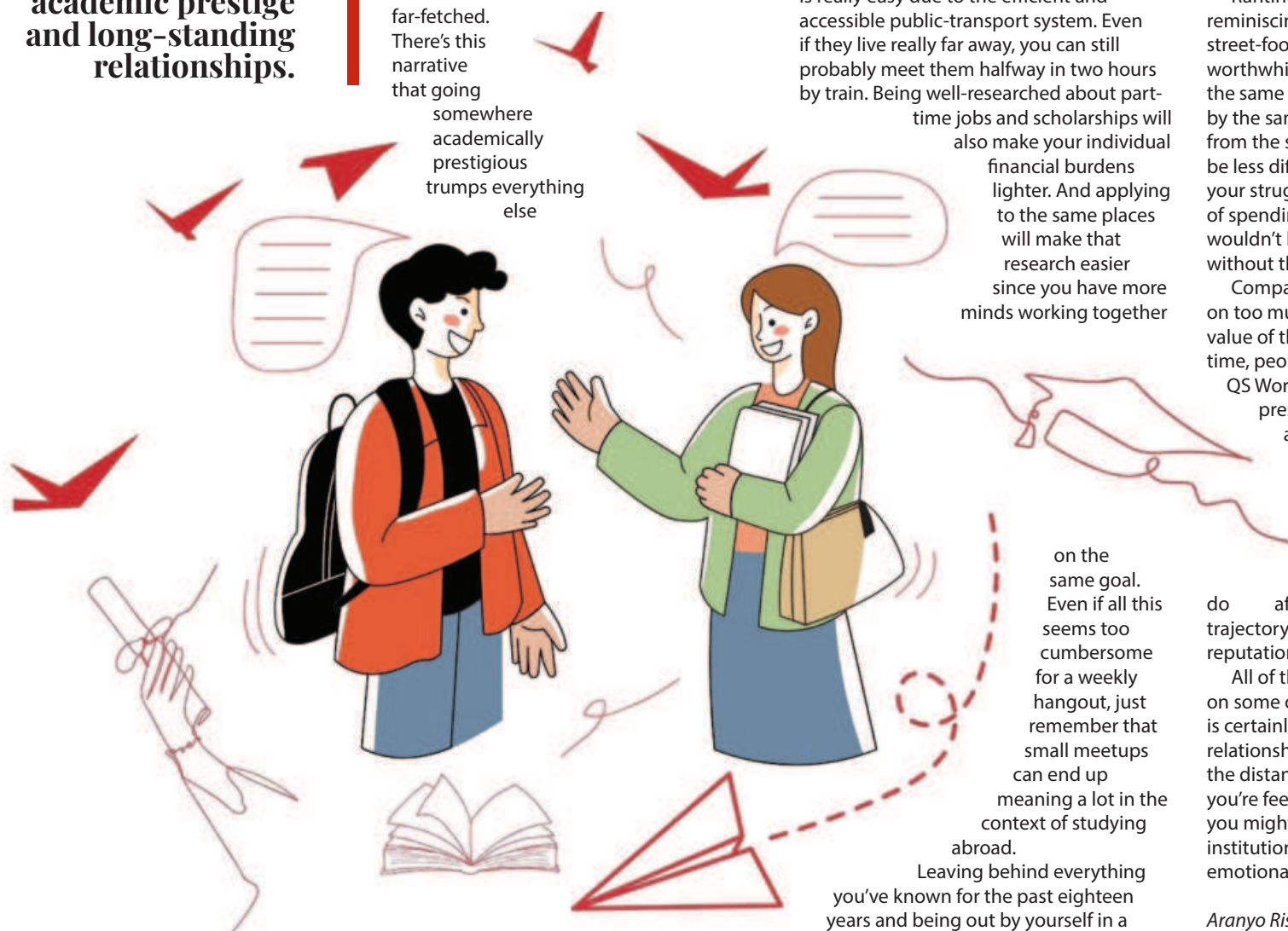
ILLUSTRATION: ADRITA ZAIMA ISLAM

Leaving behind everything you've known for the past eighteen years and being out by yourself in a country where you're unfamiliar with