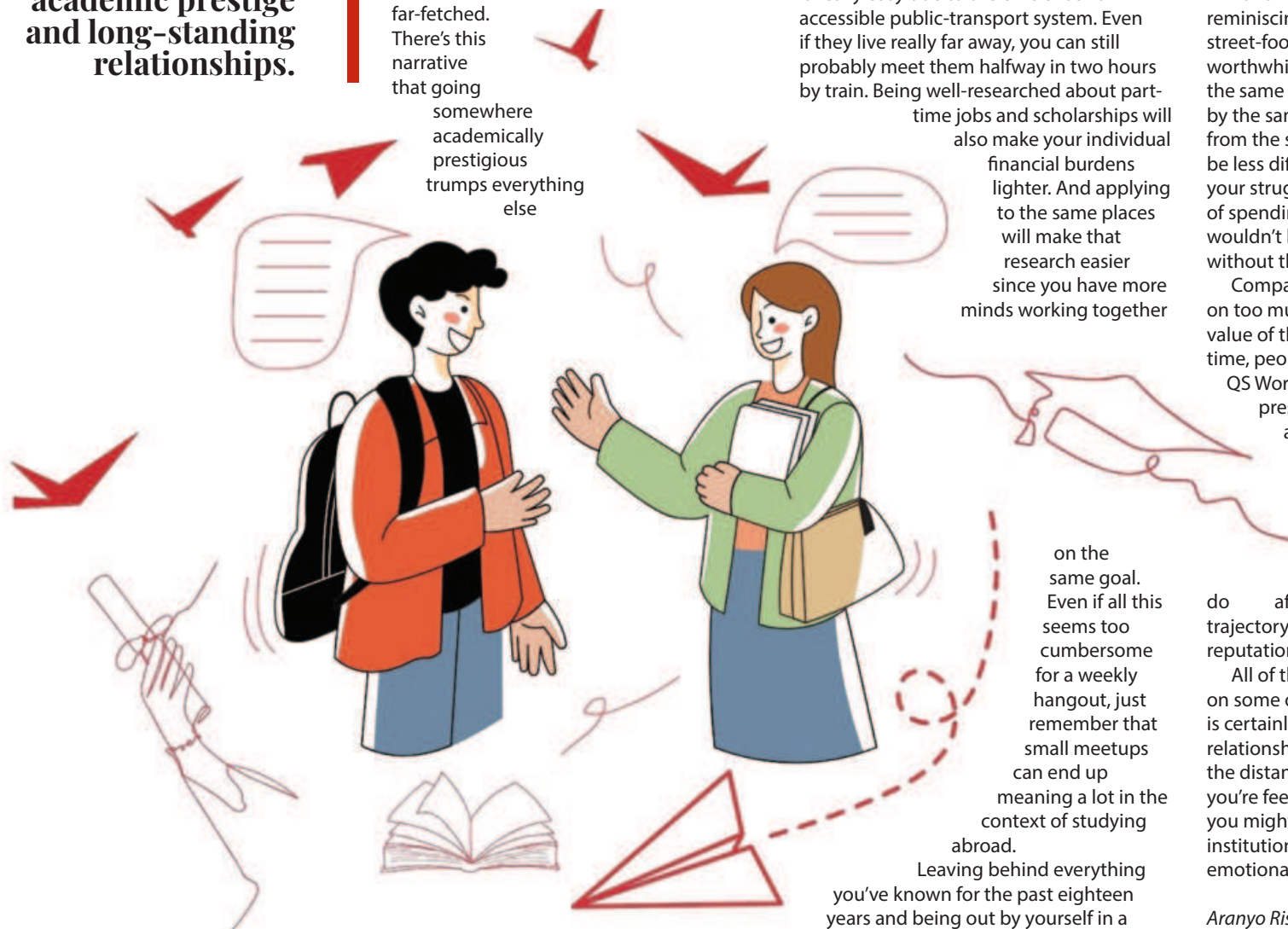
ILLUSTRATION: ADRITA ZAIMA ISLAM

Leaving behind everything you've known for the past eighteen years and being out by yourself in a country where you're unfamiliar with