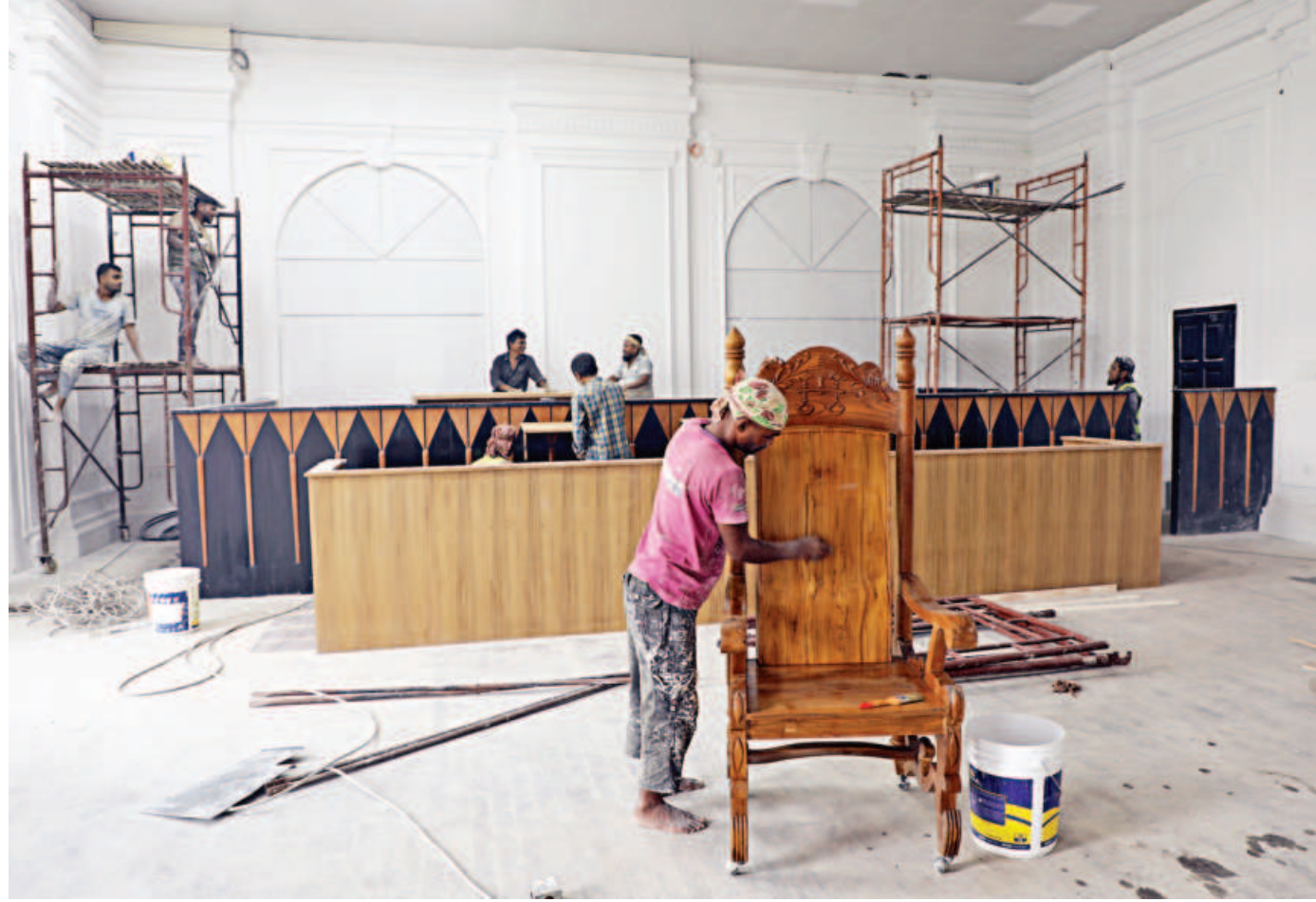
Workers renovating a courtroom for the International Crimes Tribunal where proceedings would begin from November 3 of cases filed over crimes against humanity and genocide during the mass uprising.