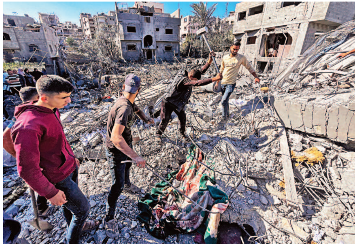
People search the rubble for missing persons at the site of an Israeli strike that hit the Al-Loh family home in Beit Lahia, in the northern Gaza Strip yesterday.

When researchers processed the data using archaeological methods, they saw what others had missed: A huge ancient city that may have housed between 30,000 and 50,000 people at its peak between 750 and 850 AD.