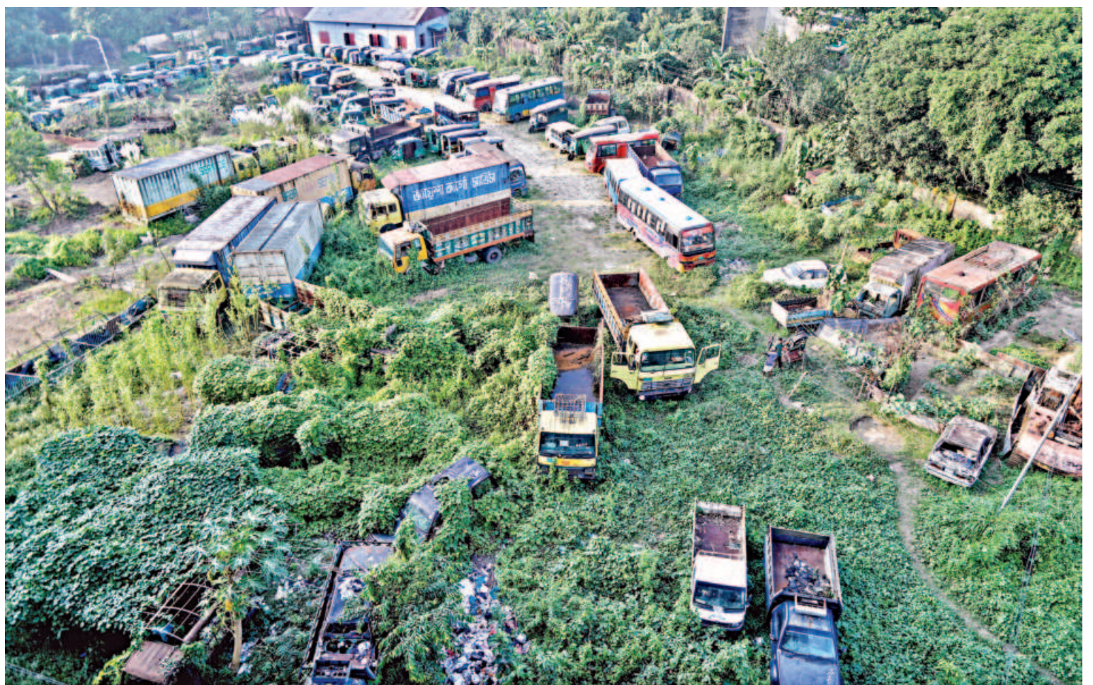
Numerous vehicles lay abandoned across the Mansurabad Police Lines dumping field in the port city. These vehicles were seized due to invalid documentation or for their involvement in certain cases, but now they just take up space and decay in this open field without any proper process for their disposal. The photo was taken yesterday.