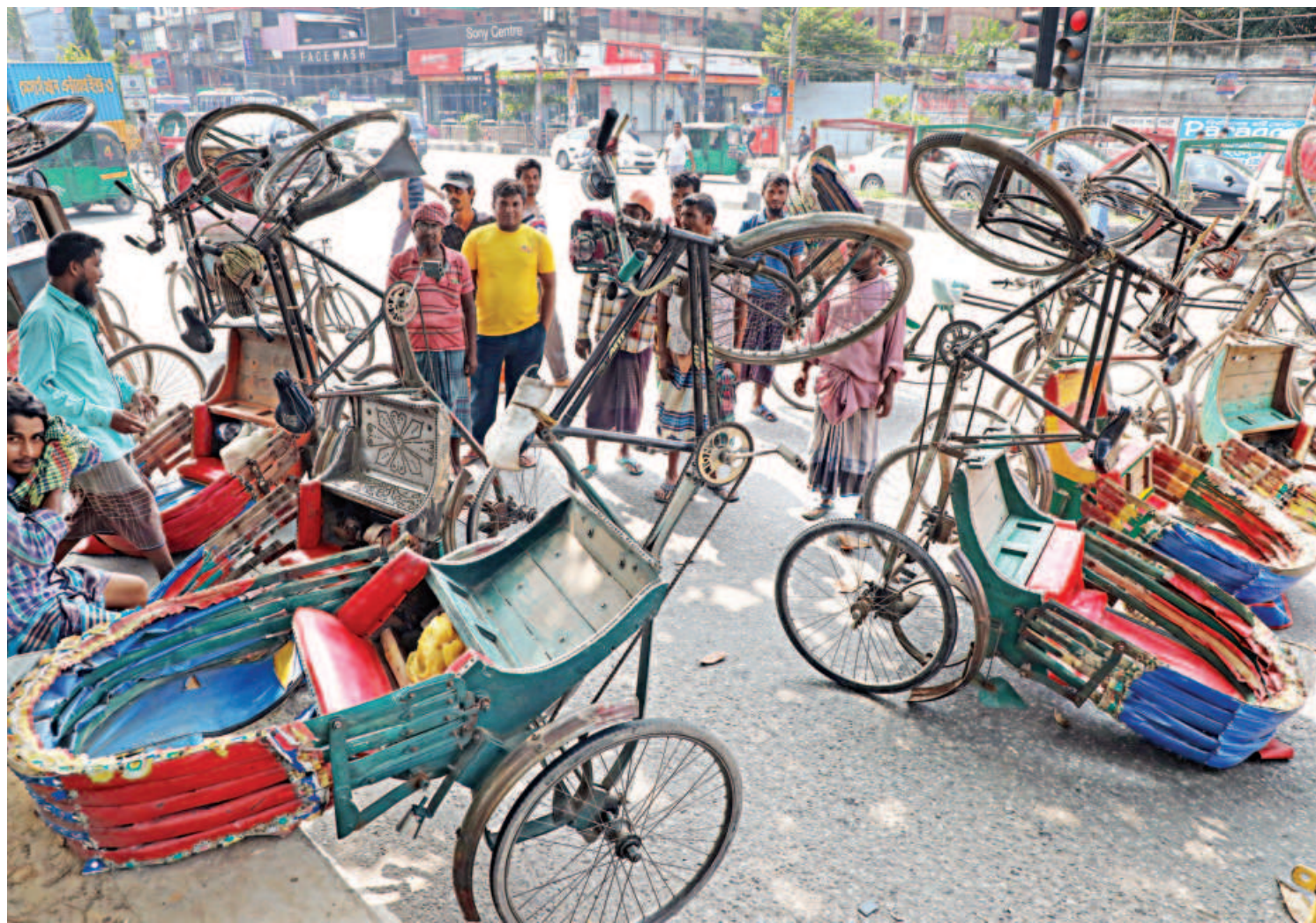
Traffic police stopped and seized all of these rickshaws for illegally plying the VIP road near Manik Mia Avenue yesterday. An initial lack of police presence following August 5 enabled many rickshaw pullers to start plying such roads. Recently, traffic police have started conducting drives against such illegal activities.

He was laid to rest in his family graveyard in Hashanhati village following three namaz-e-janazas yesterday.