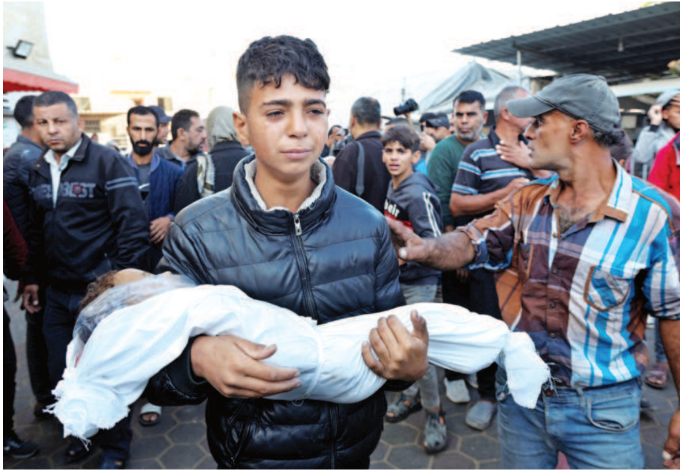
A Palestinian boy cries as he carries the body of a child, who was killed in Israeli strikes, at Al-Aqsa Martyrs Hospital in Deir Al-Balah in the central Gaza Strip yesterday.