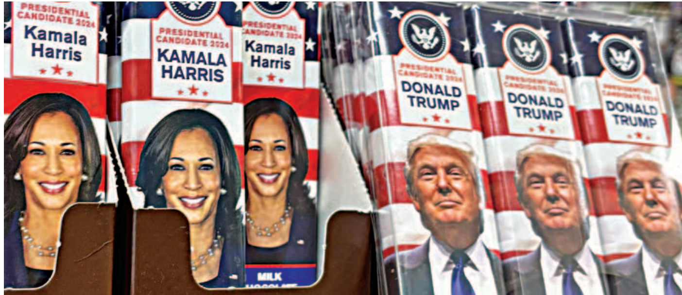
Presidential Candidate Milk Chocolates sold in Hudson stores at John F. Kennedy Airport in New York, US, taken on October 25, 2024.

The uncertainty surrounding a global phenomenon such as the US elections is amplified in the current times, as there’s an answer to everything on social media; the mainstream media too, is filled with predictions and probabilities like a game. But despite all these thorough political analyses of all different scenarios, we can still say we just don’t know. If one is sure that “Trump will win” or “Harris will win,” it is nothing but a guess.