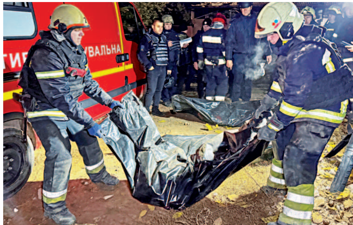
Rescuers recover the body of a person from under the debris of a private house which was hit by a Russian missile strike in Kharkiv, Ukraine yesterday. The Russian army advanced 478 sq kms into Ukrainian territory in October, a record since March 2022 in the first weeks of the war, according to an analysis.

Many Americans are in a constant state of sticker shock. That may explain why voters in the seven battleground states that will determine the winner of the November 5 election have a negative view of the economy, with 61 percent saying it is on the wrong track in a Reuters/Ipsos poll this month, and 68 percent saying the cost of living was on the wrong track. Vice President Kamala Harris, the Democratic nominee, and Trump have proposed different fixes. Harris has promised to fight price gouging and boost a child tax credit, while Trump has proposed cutting taxes on overtime pay, imposing blanket tariffs on imports that he says will bring manufacturing back to the US and mass deportation of immigrants. Trump's proposed tariffs and deportation threats will drive up prices for goods and services, many economists say, while Harris' price-gouging ban is untested on a federal level. Still, when asked which candidate had the better approach on issues, Trump led on the economy - 46 percent to 38 percent, this month's Reuters poll showed. People who study economics say they feel voters' frustration even if they don't think Trump's plan will help.