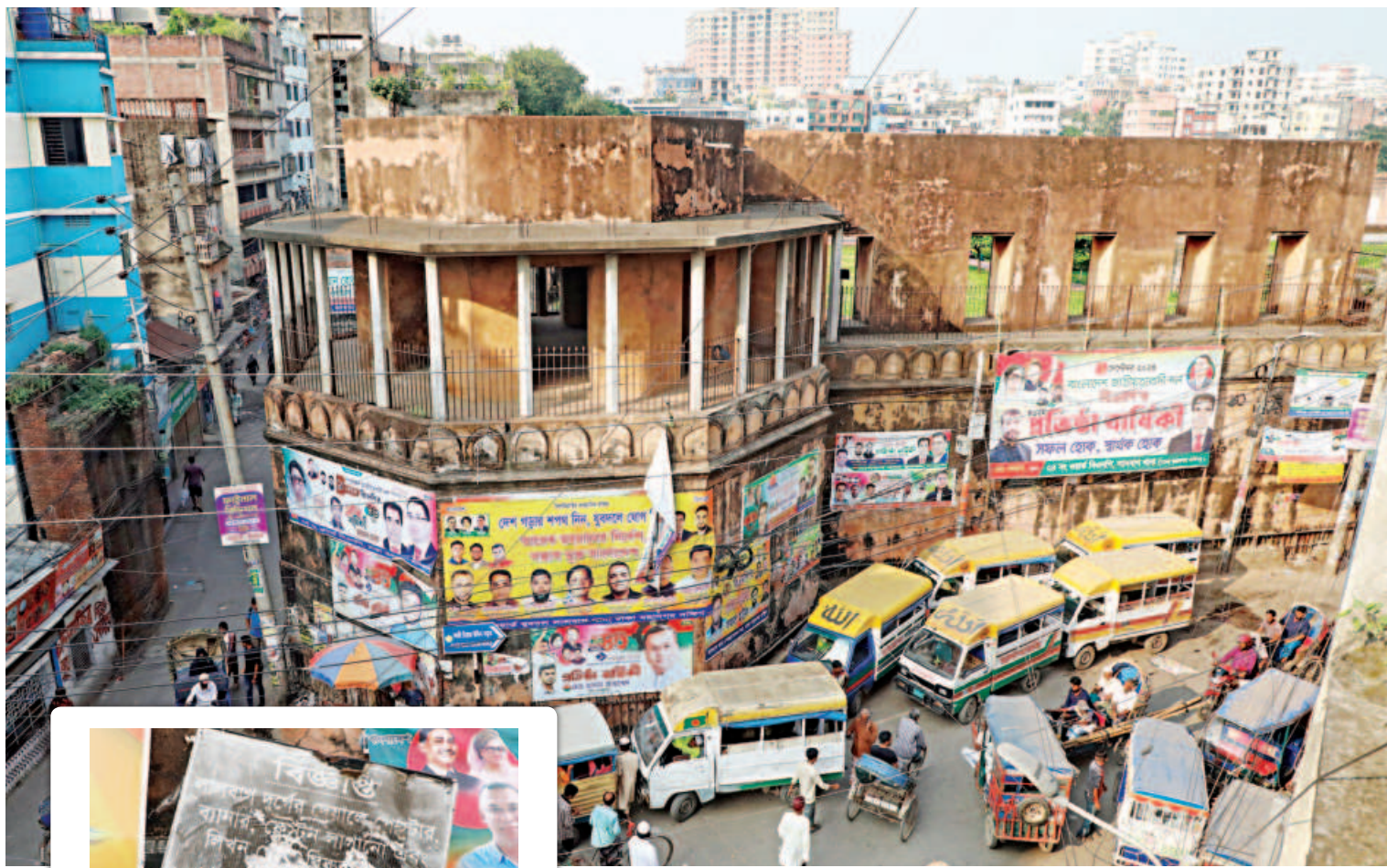
Despite Lalbagh Fort being a heritage site and laws prohibiting the plastering of banners or posters on its walls, inset , political parties continue to disregard these regulations. Previously pasted with Awami League posters, the walls are now covered with BNP ones.