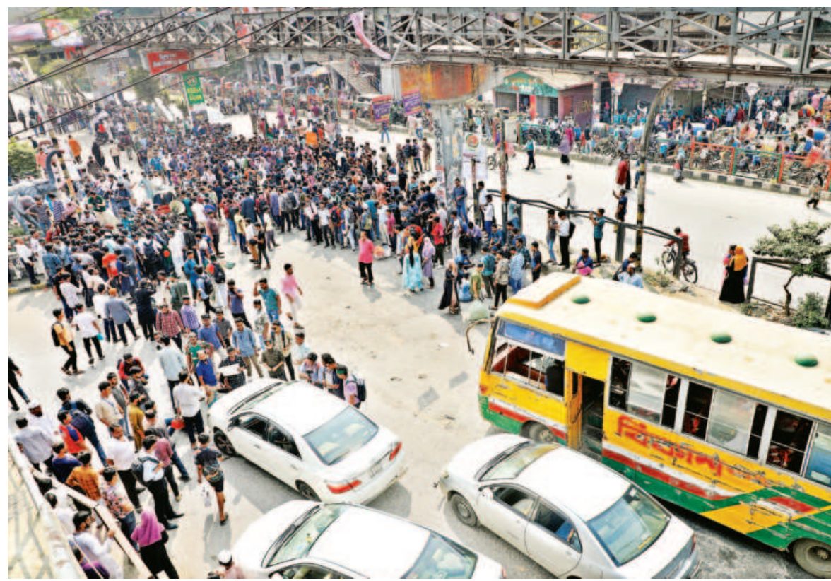
Students of seven colleges affiliated with Dhaka University demonstrate blocking the Science Lab intersection yesterday demanding transformation of their colleges into a new independent public university. The protest led to heavy traffic congestion in and around the area. Story on page 3.