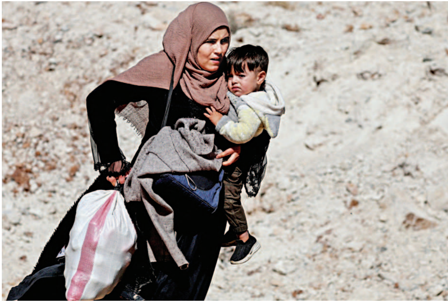
A woman carries a child while crossing from Lebanon into Syria, as she flees the ongoing hostilities between Hezbollah and Israeli forces, at the Masnaa border crossing, Lebanon. The photo was taken on Monday and released yesterday.

REUTERS, Beirut Israeli strikes on Lebanon's Bekaa Valley overnight killed more than 60 people across a dozen towns, the district governor said yesterday, the deadliest day yet in the area in more than a year of hostilities. Rescue workers were still pulling bodies out of the rubble yesterday morning. Israel has ramped up its air strikes across Lebanon over the last month, saying it is targeting Lebanese armed group Hezbollah. Lebanese officials, rights groups and residents of affected towns say the strikes are indiscriminate. No evacuation orders were given for any of the towns struck overnight. District governor Bachir Khodor said 67 people had been killed and more than 120 wounded and the death toll was expected to rise.