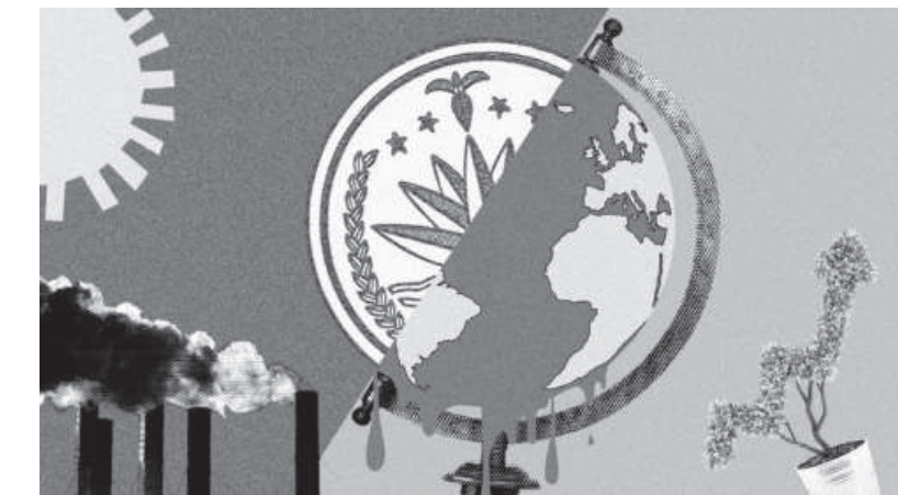
VISUAL: ANWAR SOHEL

our current economic structure, we ignore the immense cost of the environmental damage being inflicted on the planet. Six out of the nine planetary boundaries—critical thresholds that keep Earth habitable—are already overshoot beyond their safe operating limits. These boundaries