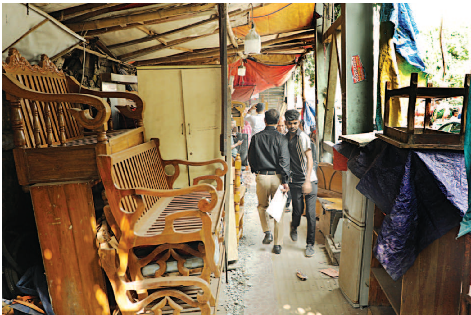
Traders have set up makeshift used furniture shops on the footpath right underneath the footbridge near Ideal School and College in the capital's Motijheel, making it difficult for pedestrians to pass. The photo was taken yesterday.