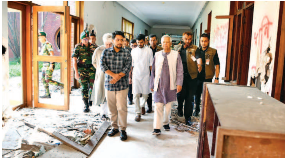
Chief Adviser Prof Muhammad Yunus visits the Gono Bhaban, the former official residence of deposed prime minister Sheikh Hasina, yesterday. The Gono Bhaban will be transformed into a museum commemorating the July uprising. Story on page 2.