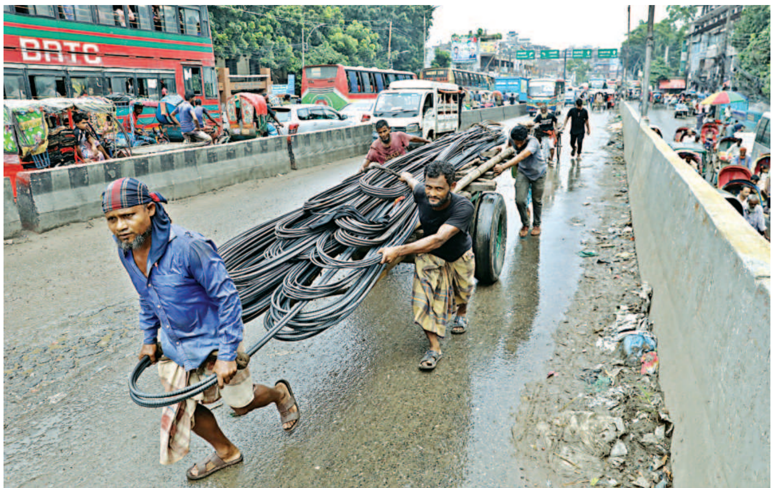
Four men push a cart carrying steel rods on the Buriganga Second Bridge in Old Dhaka's Badamtali area, defying rules, as slow-moving vehicles are banned from operating on the bridge. While the plying of such vehicles can cause traffic congestions on the bridge, carrying steel rods openly in this manner can also pose risks of accidents. The photo was taken recently.