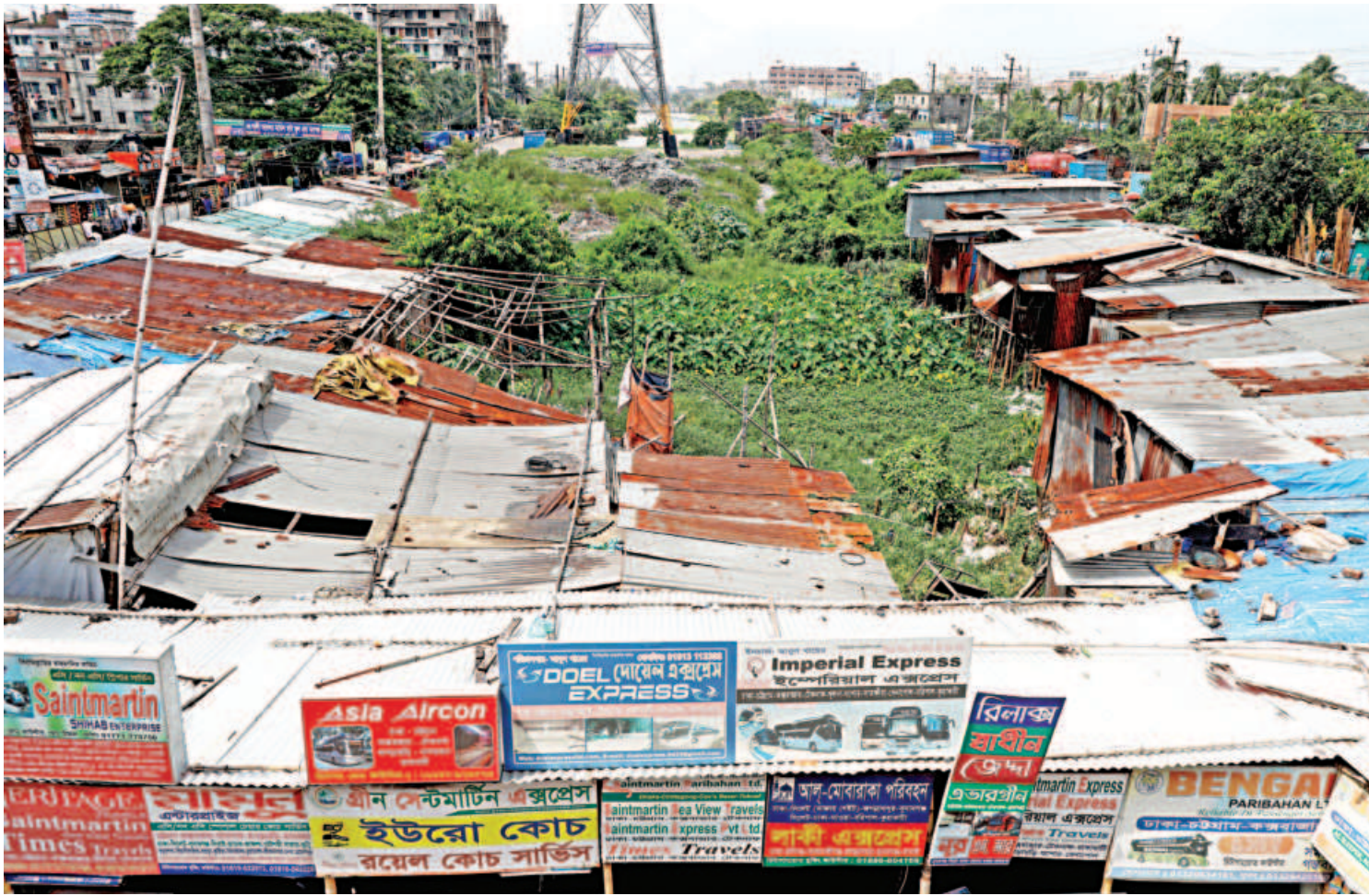
The DND canal along the Dhaka-Chattogram highway in Fatullah has been encroached upon by shops and different settlements. Such encroachment of waterbodies keeps going unabated in different parts of the country, causing severe environmental and waterlogging issues. The photo was taken recently.

The home adviser also assured that the issue of increasing the risk allowance for the officials and employees of the fire service department will be considered.