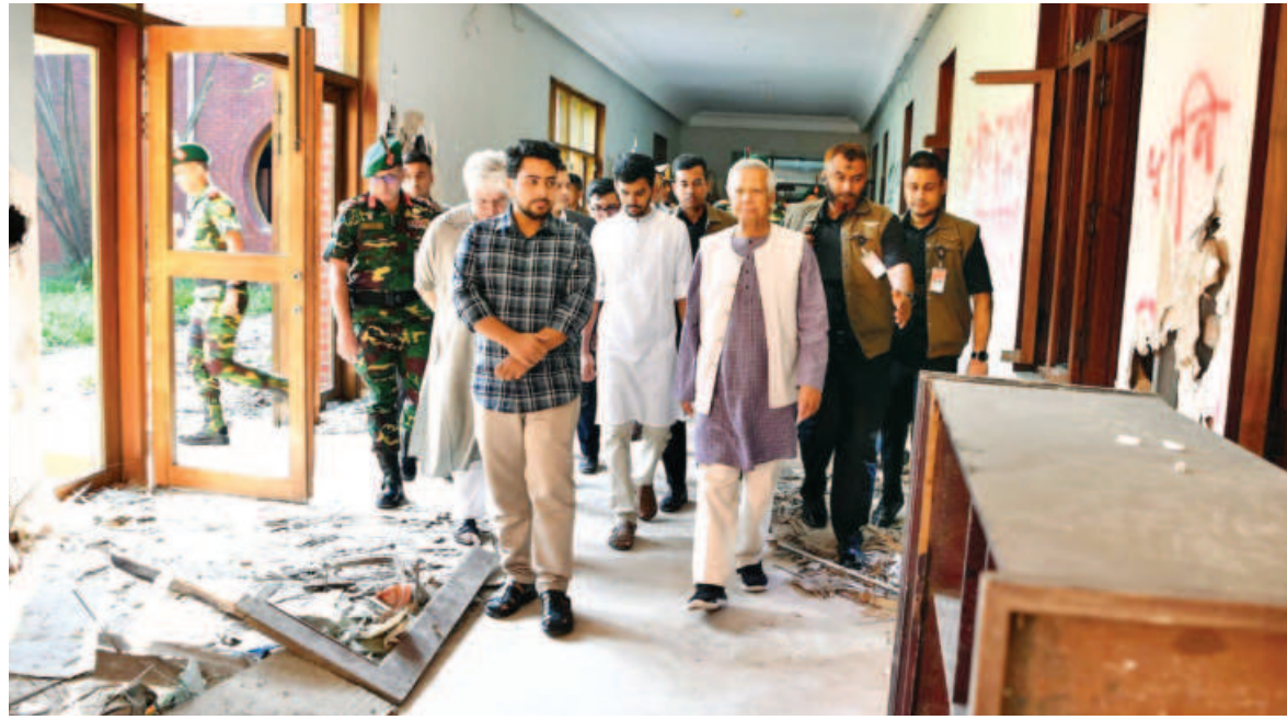
Chief Adviser Prof Muhammad Yunus visits the Gono Bhaban, the former official residence of deposed prime minister Sheikh Hasina, yesterday. The Gono Bhaban will be transformed into a museum commemorating the July uprising. Story on page 2.