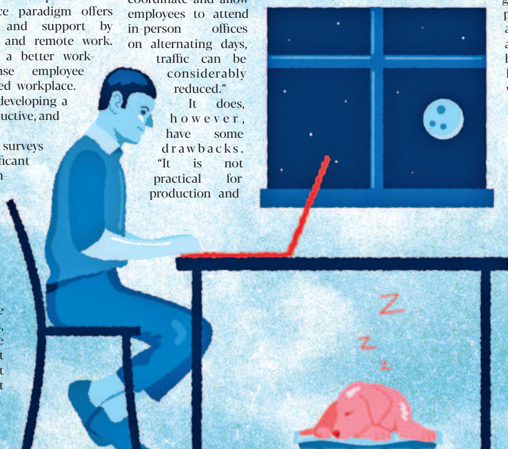
ILLUSTRATION: ZARIF FAIAZ

traffic congestion greatly reduces productivity at work and costs time, could a well-balanced hybrid approach help to truly improve work-life balance while also increasing productivity? Time will tell.