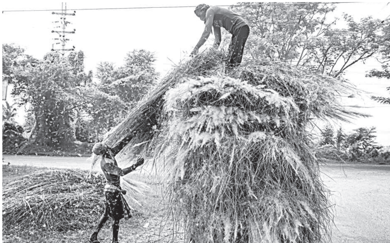
Rasel and Islam Sheikh collect Kaash Phool (Kans grass) straws and load them onto a van. They bundle these together and then sell them at a local market for Tk 10 per bundle. The photo was taken from the Aranghata area of Khulna recently.

FROM PAGE 3 admission application. For students with special needs, age requirement may be relaxed for up to five years, according to the policy. The digital lottery process for admission will be conducted centrally by the Directorate of Secondary and Higher Education. The Secondary and Higher Education Division will set the digital lottery's date, time, and application fees.