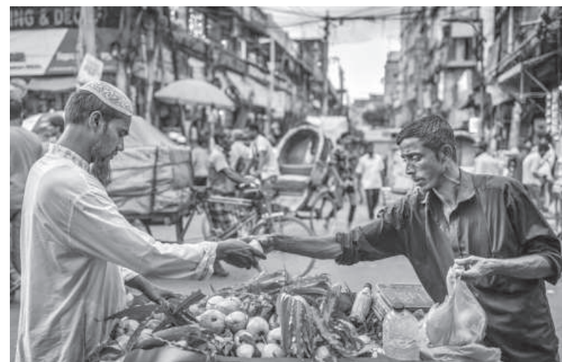
Over the last 10-year period, general inflation increased by 45 percent, while food inflation rose by over 36 percent.

First, fiscal and monetary policies must be coordinated to tackle inflation effectively. For much of the previous fiscal year, the monetary policy was expansionary, while