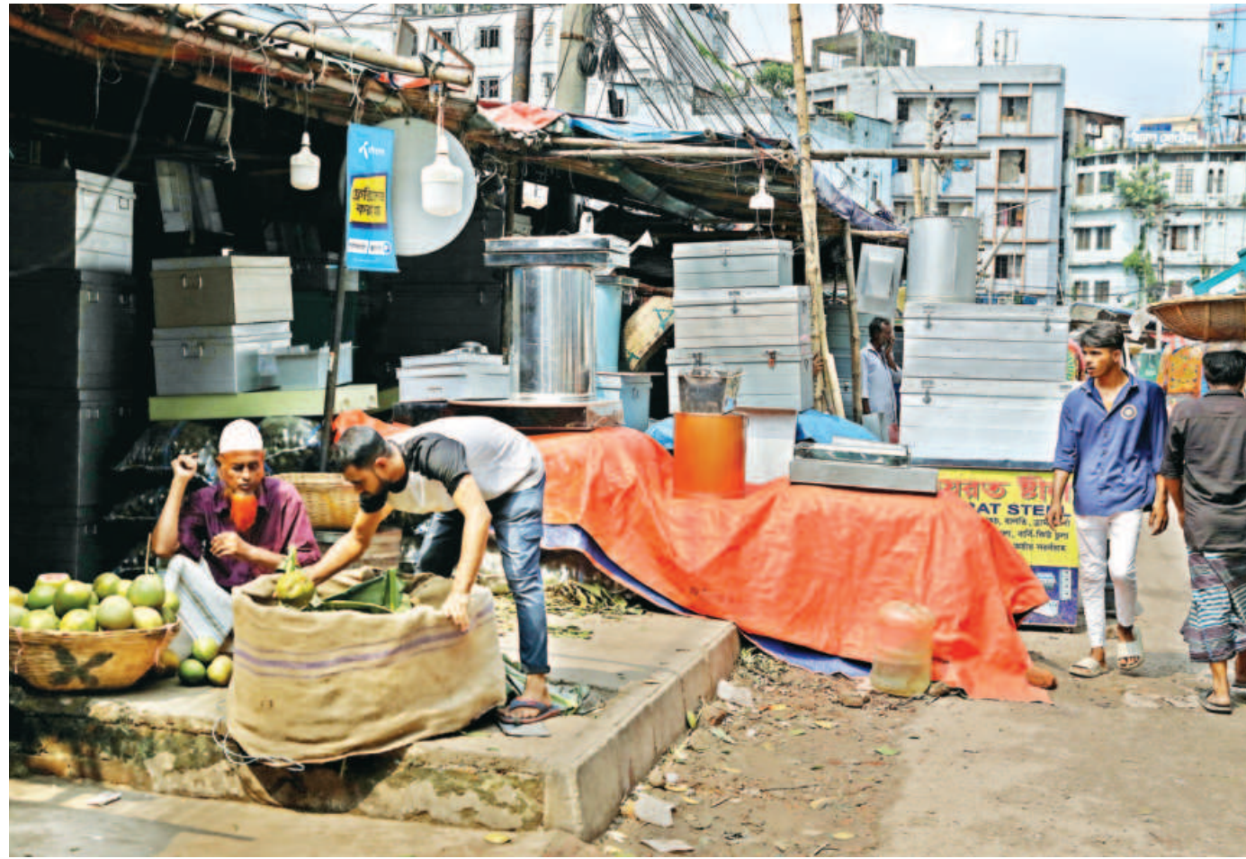
Workshops that make trunks keep those on a footpath near the DNCC kitchen market in the capital's Karwan Bazar, obstructing pedestrians. The photo was taken yesterday.