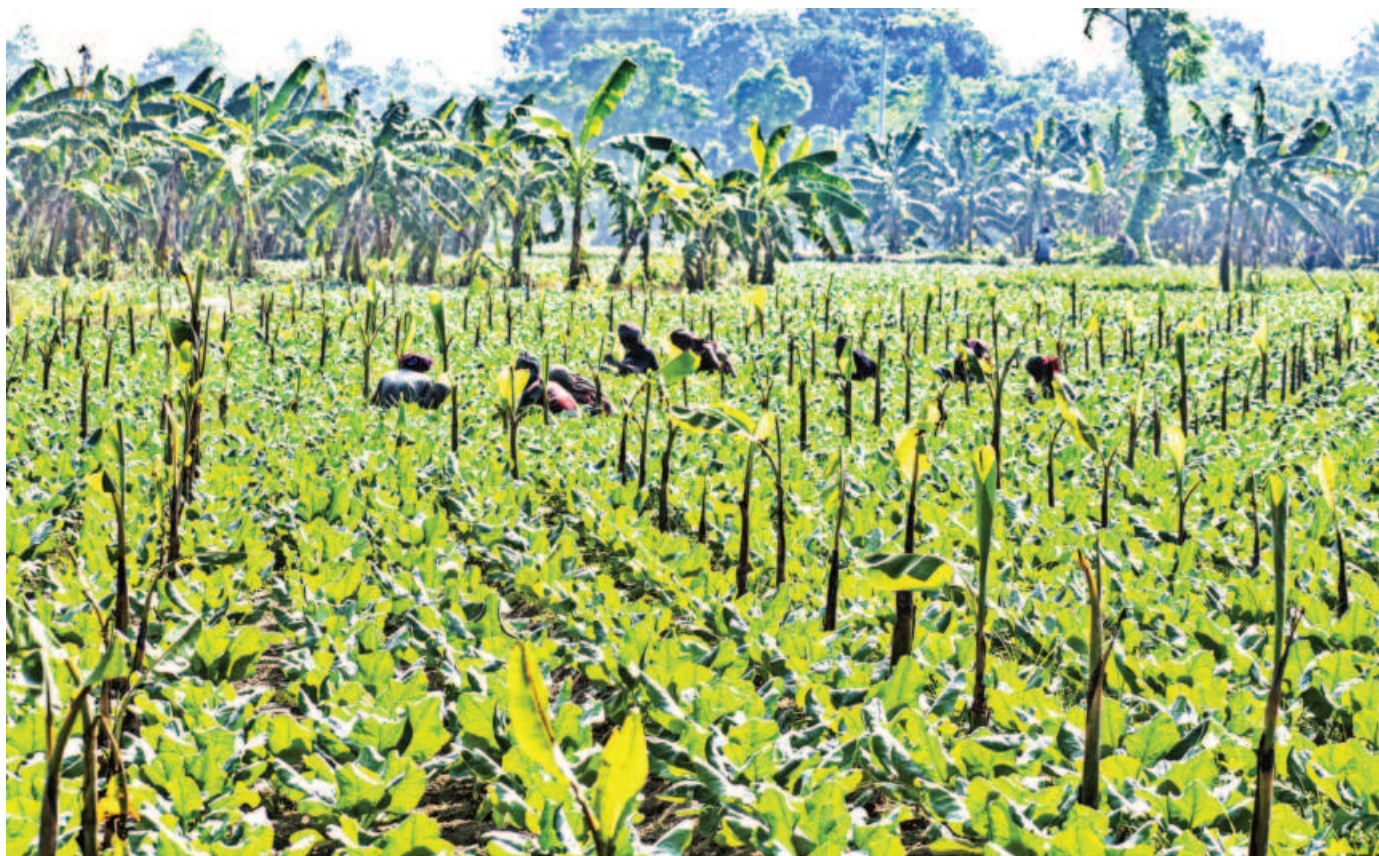
Farmers tending to cauliflower plants at Mukamtola in Shibganj upazila of Bogura, one of the biggest vegetable-producing areas in the country. They grow this winter vegetable in a banana orchard. The photo was taken recently.