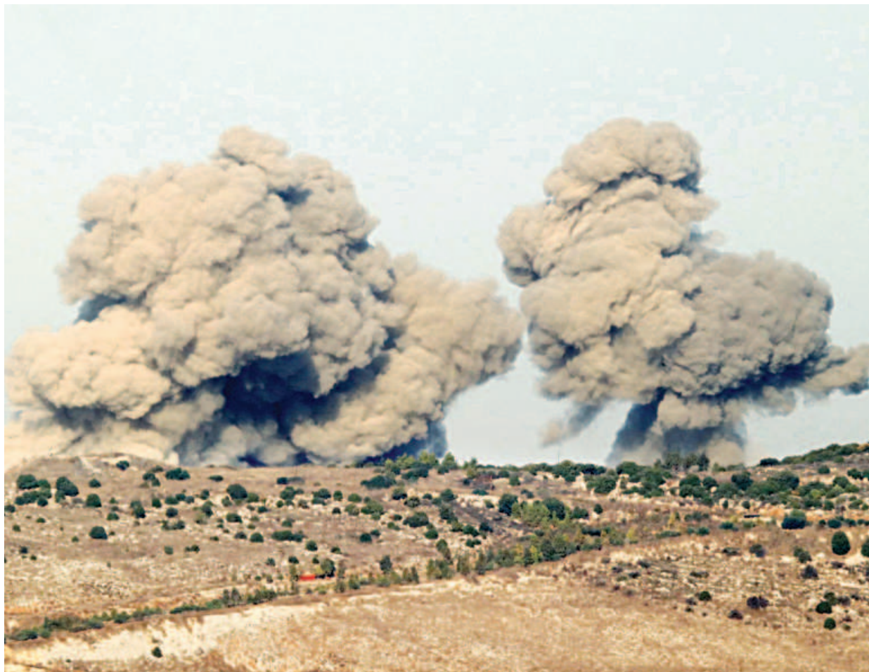
Smoke rises from the site of an Israeli airstrike that targeted the area of Nabatieh in southern Lebanon yesterday, amid the ongoing war between Israel and Hezbollah.