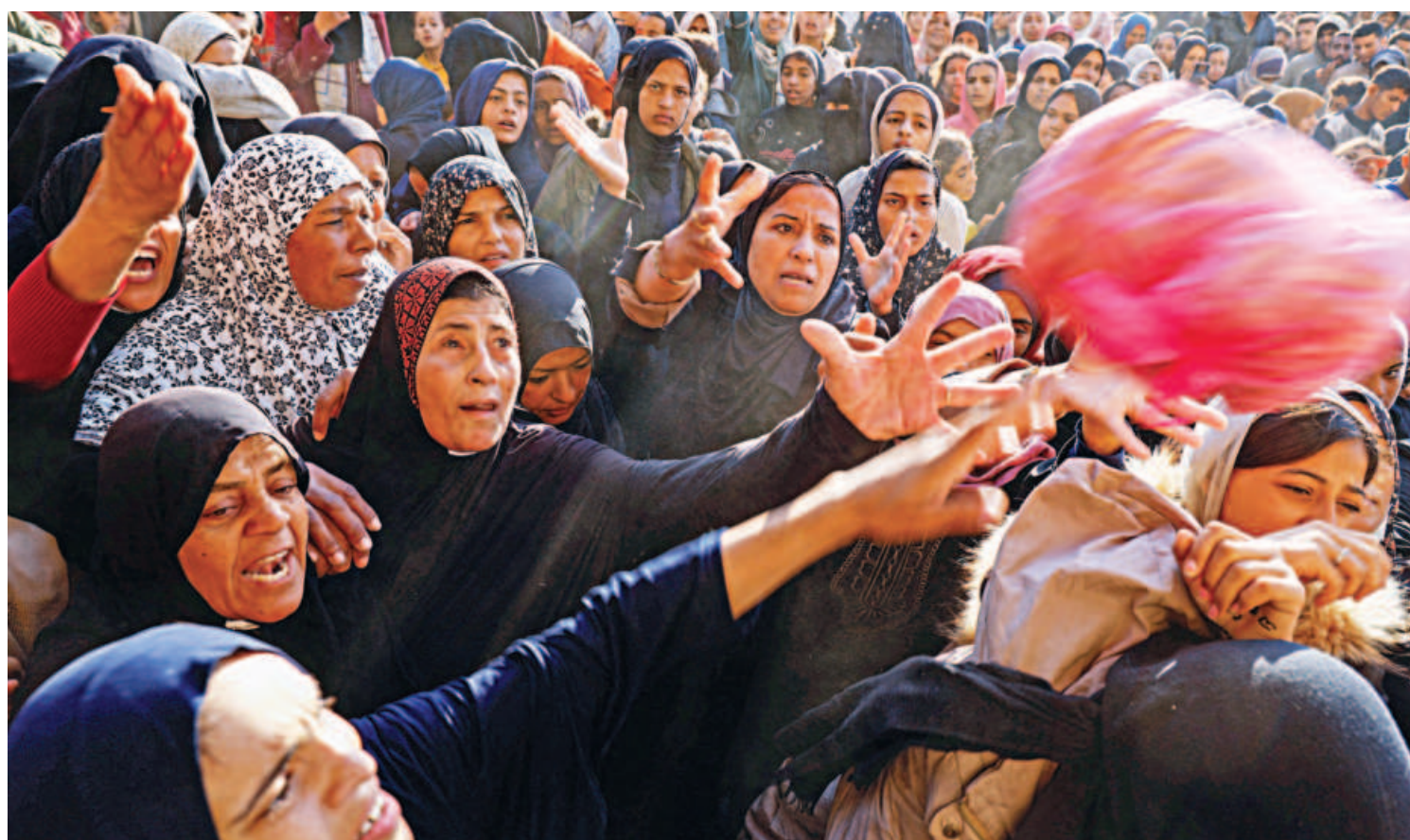
Palestinians gather to buy bread from a bakery, amid the Israel-Hamas conflict, in Khan Younis in the southern Gaza Strip yesterday. The amount of international aid entering Gaza has plummeted to its lowest level all year, according to UN data, while a global hunger monitor has also warned of a looming famine.

Meanwhile, Russia said it took another village in eastern Ukraine, south of the city of Pokrovsk where its forces have been advancing for months. Moscow's forces, outnumbering and outgunning Ukrainian army, advanced fast towards Pokrovsk since summer.