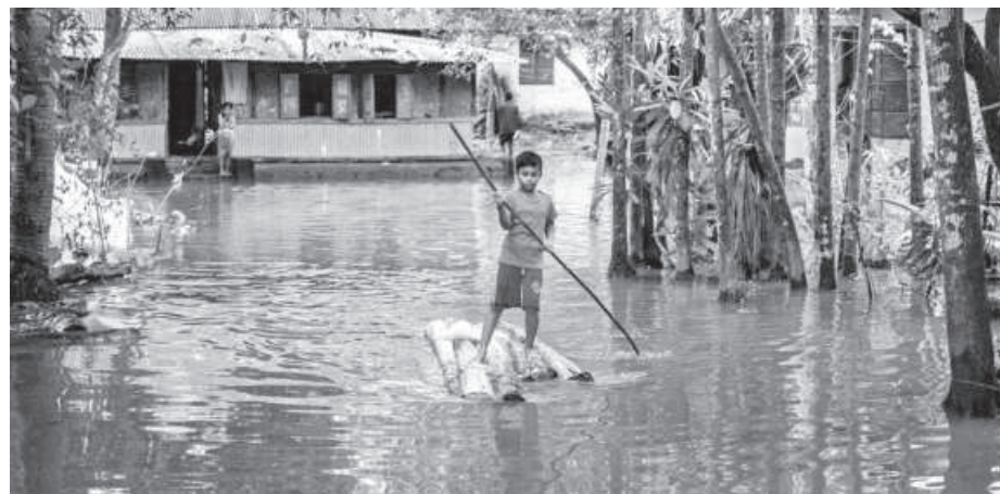
The unique perspectives and experiences of the youth must be incorporated into climate change policies to address the diverse impacts of climate change on different communities.

solutions. Involving women in developing funding criteria and resource allocation helps prioritise projects that directly benefit communities, and enhance resilience and adaptive capacity. When women and minorities participate actively in shaping technologies and solutions, we foster creativity and innovation that are essential for tackling climate challenges. This needs to happen at global climate discussions and at