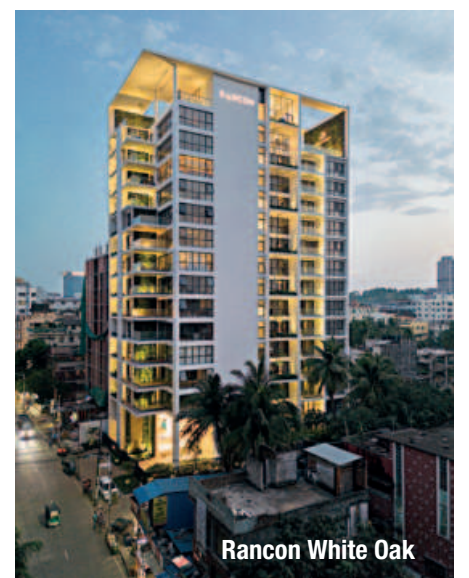
Rancon White Oak

In conclusion, Rancon is steadfast in its commitment to building an eco-friendly and sustainable city. Rancon's vision extends beyond serving the wealthy; it is equally devoted to ensuring that middle-class families have access to affordable, sustainable housing options, reinforcing the belief that love for the city can be realized through responsible development.