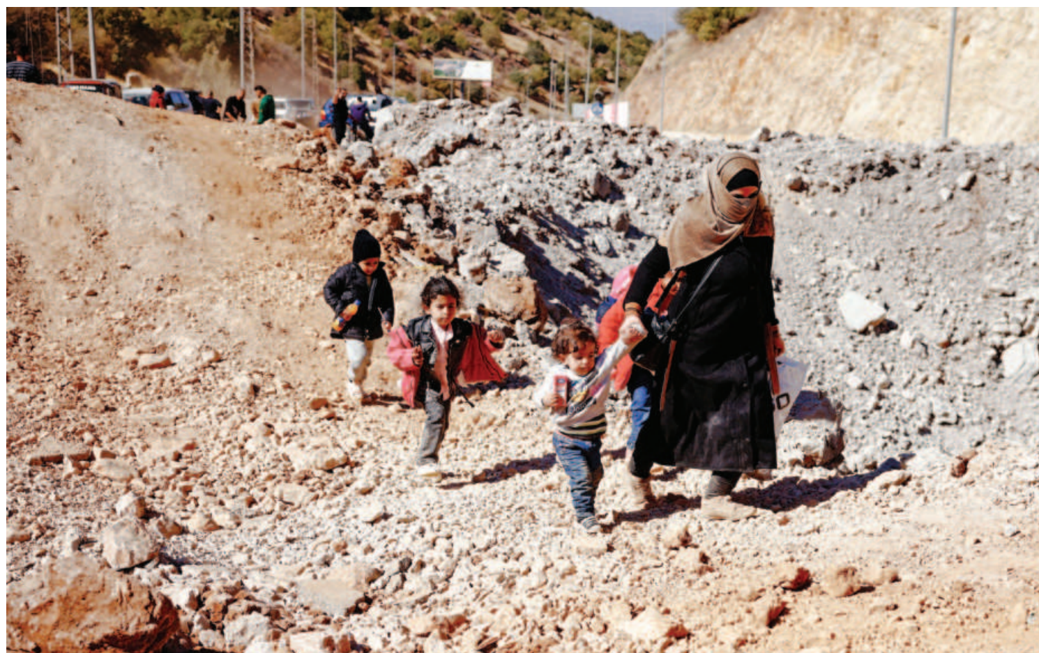
A woman walks with children while crossing from Lebanon into Syria on foot at the Masnaa border crossing as they flee the ongoing hostilities between Hezbollah and Israeli forces, in Al Masnaa, Lebanon yesterday.