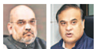
Amit Shah Himanta

Two senior leaders of India's ruling Bharatiya Janata Party (BJP), Home Minister Amit Shah and Assam Chief Minister Himanta Biswa Sarma, said yesterday that infiltration from Bangladesh was on the rise and that coordinated efforts to stop it were needed to ensure regional peace and stability. Shah, on his first visit to West Bengal in six months, raised the issue of cross-border infiltration at two separate events, at one of which he accused Chief Minister Mamata Banerjee's government of being involved in "state-sponsored infiltration" and corruption. At both events, Shah urged the voters in West Bengal to bring about a change of guard by putting the BJP in power in the next assembly elections in 2026 to put an end to infiltration. "Illegal migration harms India-Bangladesh peace.