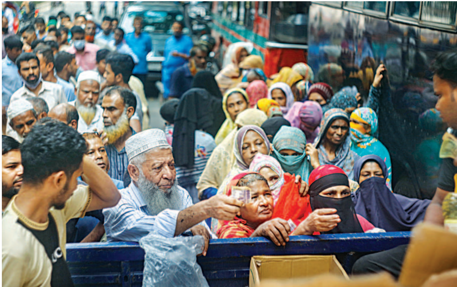
People waiting in front of a TCB truck to buy essentials at subsidised prices on Abdul Goni Road near the Secretariat yesterday. The number of people purchasing commodities increases with their market prices going up.