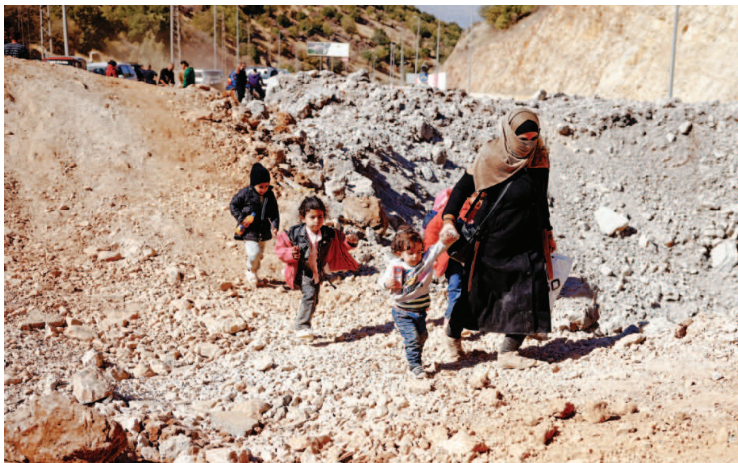
A woman walks with children while crossing from Lebanon into Syria on foot at the Masnaa border crossing as they flee the ongoing hostilities between Hezbollah and Israeli forces, in Al Masnaa, Lebanon yesterday.