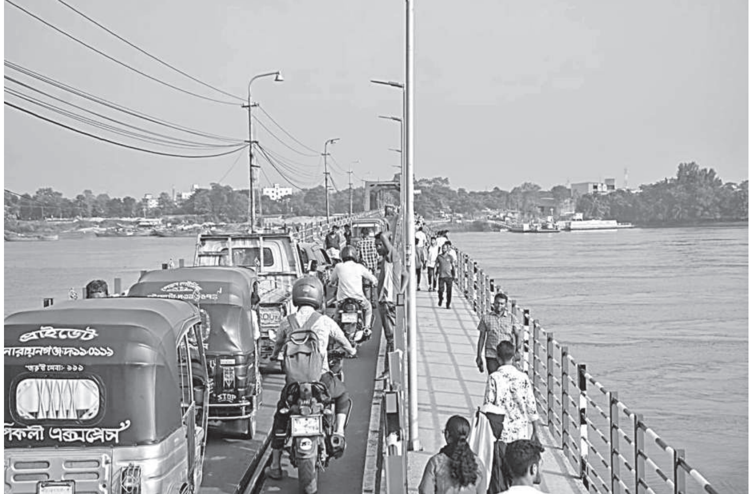
After being closed for renovation work for over a year, the Kalurghat Bridge over the Karnaphuli river was opened to traffic yesterday. The bridge was renovated at a cost of Tk 43 crore. According to the RHD, around 22,000-25,000 commuters cross the bridge every working day.

According to the RHD, ound 22,000–25,000 commuters cross the SEE PAGE 4 COL 5