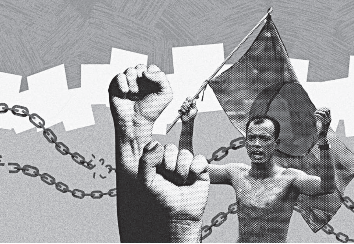
VISUAL: ANWAR SOHEL

between different types of authoritarianism. In a closed authoritarian regime, there is no pretext of elections. Under electoral authoritarianism, elections are held but without real competition between parties. Bangladesh under Hasina’s rule since 2009 was an electoral authoritarian state. Political scientists have identified a number of these hybrid regime types since the early 2000s, when nascent democracies of the 1990s—also known as “3rd wave” democracies—failed to establish liberal democracy. If anything, there has been a democratic backsliding in the world, where now seven in 10 people live in some type of authoritarian regime, when this number was five in 10 a little more than 20 years ago. Ninety-three percent of South Asians live in some sort of authoritarian regime, only second to the Middle East.