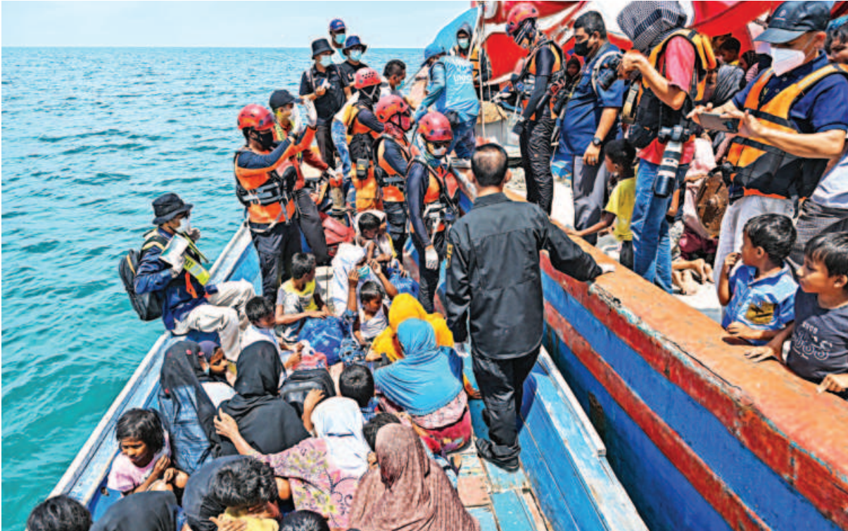
People rescue Rohingya refugees from a boat after a week anchored ashore off the coast of Labuhan Haji in Southern Aceh province yesterday. The mostly Muslim ethnic Rohingya are heavily persecuted in Myanmar and thousands risk their lives each year on long and dangerous sea journeys to reach Malaysia or Indonesia's Aceh Province.