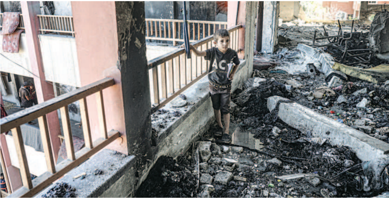
A boy walks with a notebook through debris and rubble in the balcony corridor of the Shuhada (Martyrs) school, which was hit by Israeli bombardment, in Nuseirat in the central Gaza Strip yesterday.