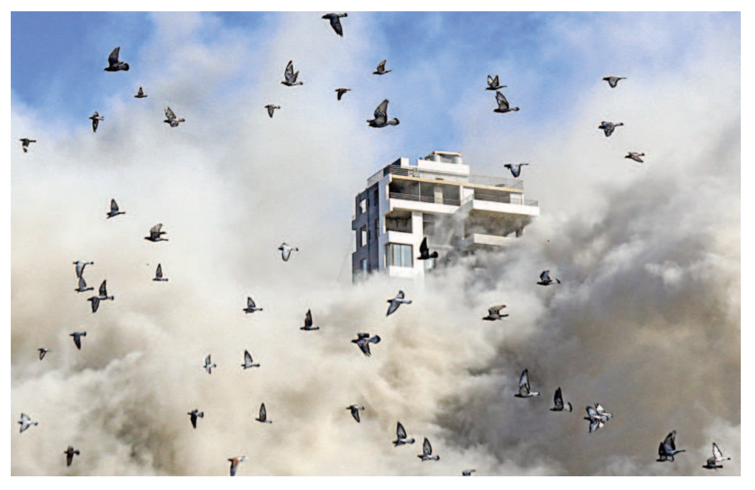
A flock of pigeons flies away as a smoke cloud erupts after a rocket fired by an Israeli war plane hit a building in Beirut's southern suburb of Shayah on October 22, 2024, amid the ongoing war between Israel and Hezbollah.