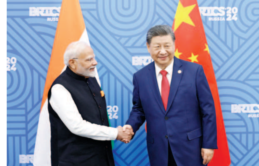
Chinese President Xi Jinping and India Prime Minister Narendra Modi meet on the sidelines of the BRICS summit in Kazan, Russia yesterday.