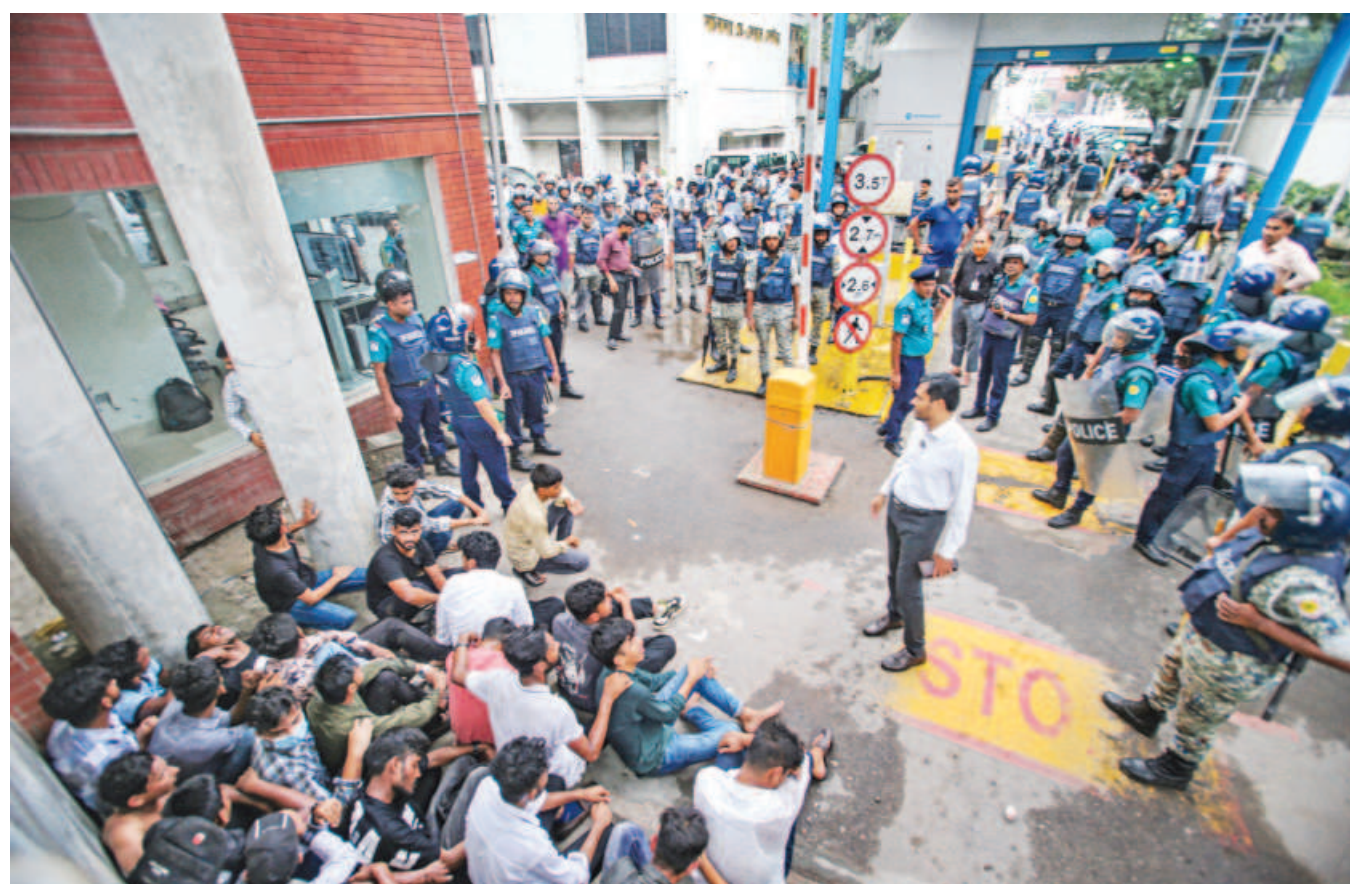
A group of HSC students, who failed or got poor results, entered the Secretariat and staged a protest yesterday, demanding reevaluation of their results. Police were eventually able to disperse the gathering and detained over 50 students. Earlier, on October 20, students entered the Secondary and Higher Secondary Education Board office in the Bakshibazar area and staged protests.