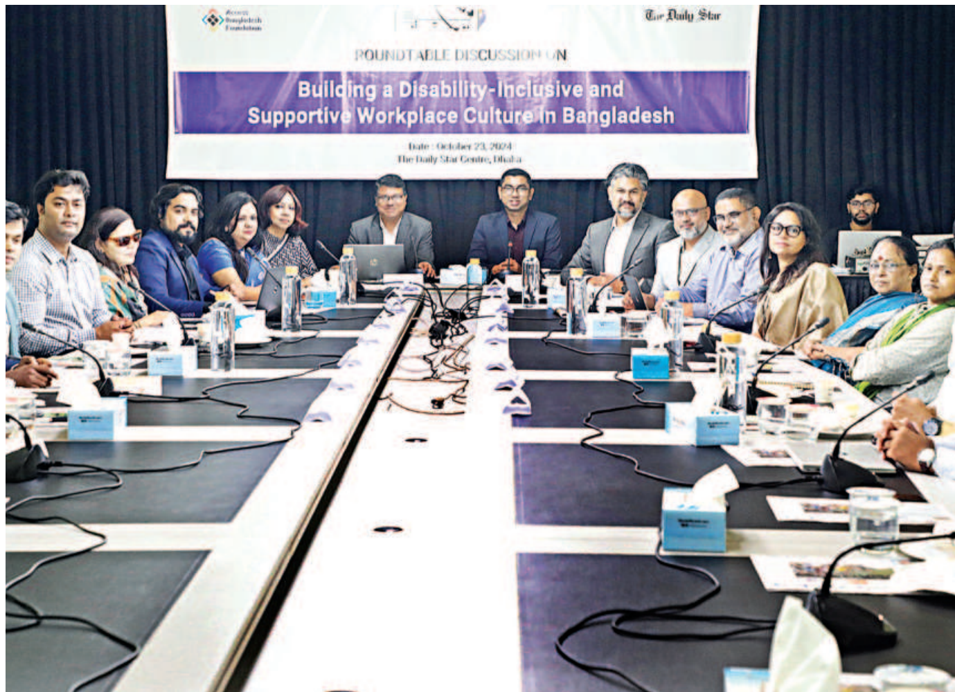
Speakers at the event titled, "Building a Disability-Inclusive and Supportive Workplace Culture in Bangladesh", jointly organised by The Daily Star and Access Bangladesh Foundation at The Daily Star Centre in the capital yesterday.