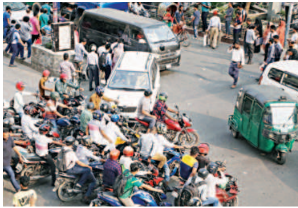
Pedestrians jaywalk across the streets amid oncoming traffic in the Banglamotor area. Despite zebra crossings and foot-over bridges being readily available, people still choose to cross the street illegally even with the risk of accidents taking place. The photo was taken recently.