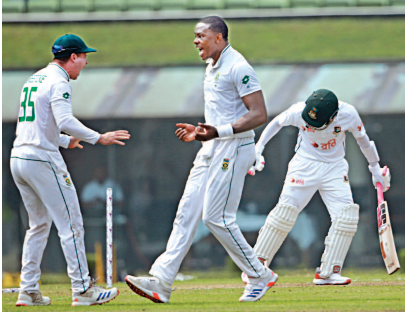
CSouth Africa pacer Kagiso Rabada celebrates his landmark 300th wicket with Matthew Breetzke after removing Bangladesh batter Mushfiqur Rahim during opening day of the first Test at the Sher-e-Bangla National Cricket Stadium in Mirpur yesterday. He became the fastest to take 300 Test wickets (11,817 balls), beating Pakistan's Waqar Younis (12,602 balls).

He is now the highest wicket-taker at Sher-e-Bangla National Cricket Stadium with 79 Test scalps, three wickets more than Shakib.