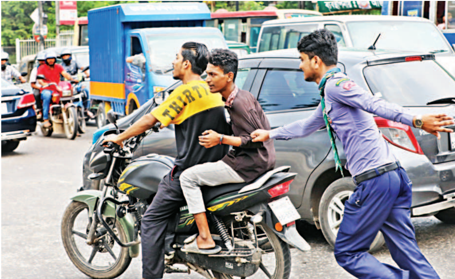
A student chases a motorcycle as the rider and passenger cruise through the street without any helmets, a clear violation of traffic law. Under a new initiative, the government is planning to formally include 300 students in the capital's traffic management system. Students will work alongside police officers to assist in regulating traffic. The photo was taken on Mirpur Road yesterday.