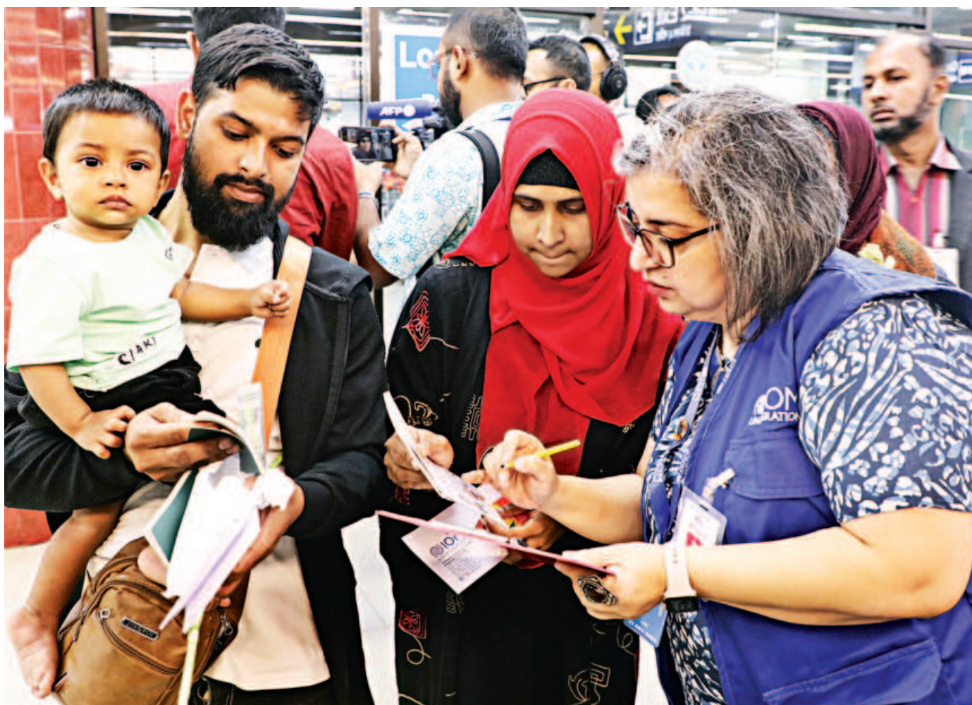
An official checks the documents of a Lebanon returnee migrant at the Dhaka airport yesterday. The first batch of 54 Bangladeshi expatriates returned from the war-torn Middle Eastern country in the evening.