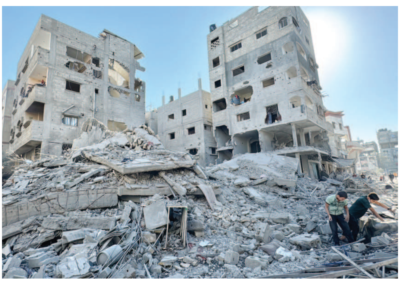
This photo taken yesterday shows the aftermath of an Israeli airstrike that reduced residential buildings to rubble in Beit Lahia, in the northern Gaza Strip on Saturday night.