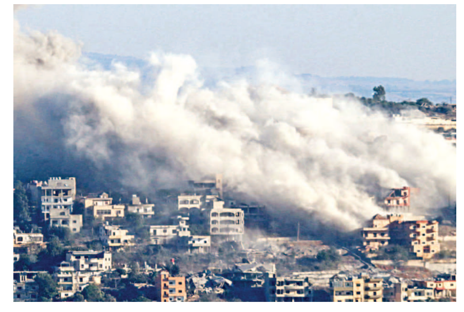
Smoke rises from the site of an Israeli airstrike that targeted the southern Lebanese border village of Khiam, where the Lebanese official media reported 14 strikes within minutes yesterday.