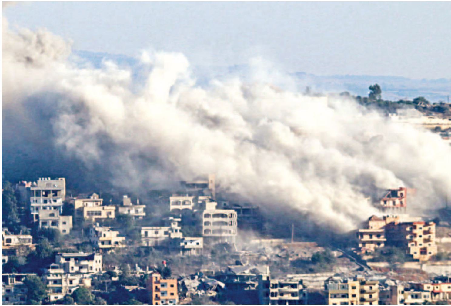
Smoke rises from the site of an Israeli airstrike that targeted the southern Lebanese border village of Kham, where the Lebanese official media reported 14 strikes within minutes yesterday.

A report in The Indian Express said that an anonymous account on X, formerly Twitter, was suspended after posting bomb threats to at least 40 flights on Friday and Saturday.