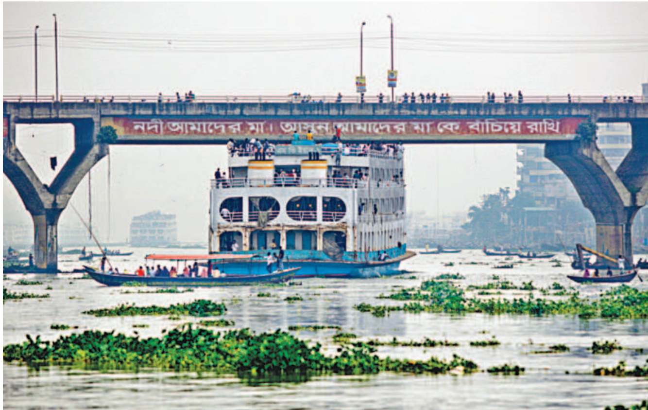
Flouting navigation rules, a launch dangerously goes beneath the Babubazar bridge over the Buriganga, putting the passengers as well as the structure at risk. Such large vessels are not allowed to ply this route. The photo was taken from the capital's Islambagh area recently.

Even after the Appellate Division upheld the HC verdict in July 2017, paving the way for making the council functional, the government filed a