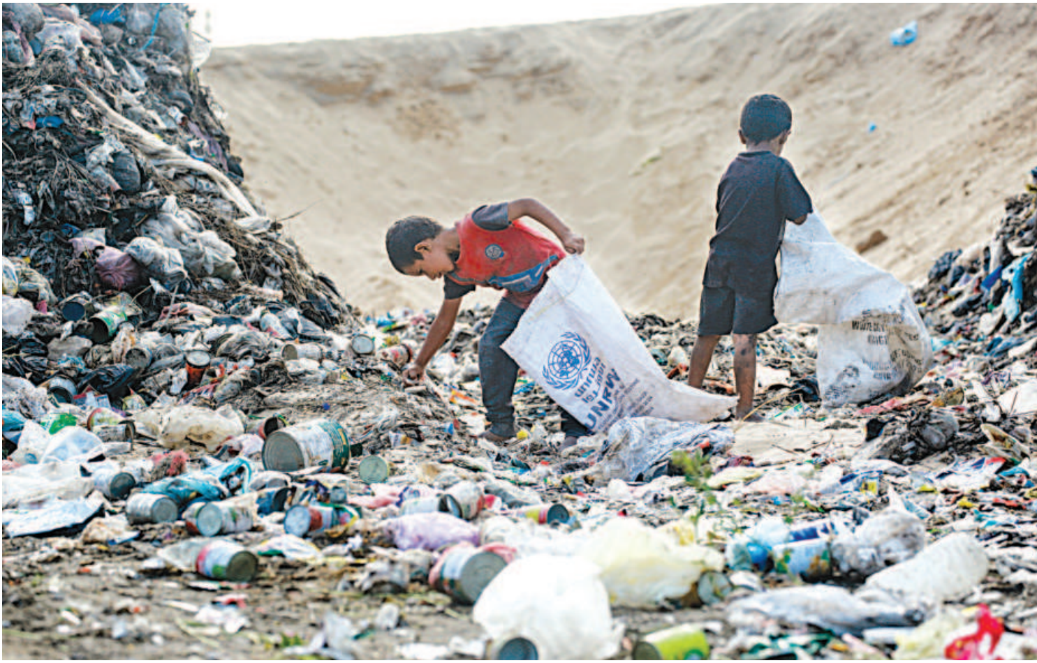
Children sift through waste at a landfill in Khan Yunis in the southern Gaza Strip on October 15, 2024.

Participants would practice tactics to ensure international maritime trade security, protect maritime routes, enhance humanitarian measures, and exchange information on rescue and relief operations, it said.