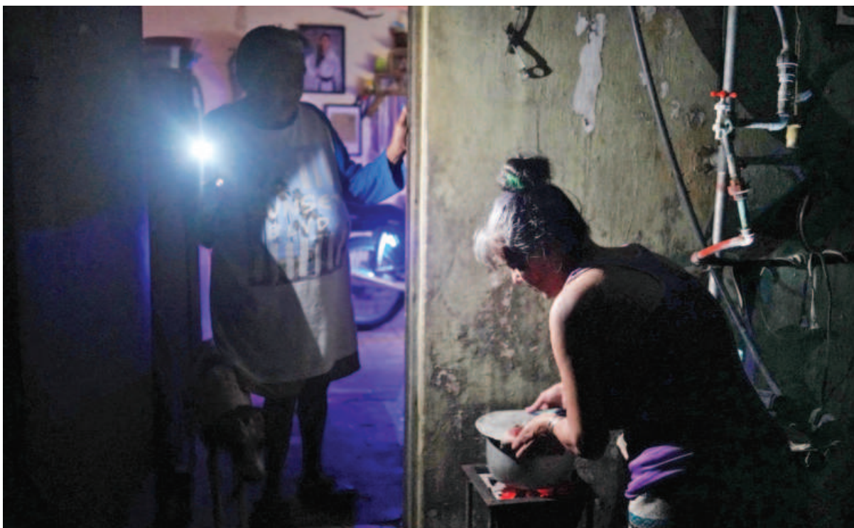
A woman boils water while another holds up a flashlight on a mobile phone during a nationwide blackout caused by a grid failure in Matanzas, Cuba, on Friday. Technical breakdowns, fuel shortages and high demand have caused the country's thermoelectric power plants to constantly fail, forcing the government to declare an energy emergency and take measures such as closing schools and factories.

But on the list are nations that include areas not considered safe.