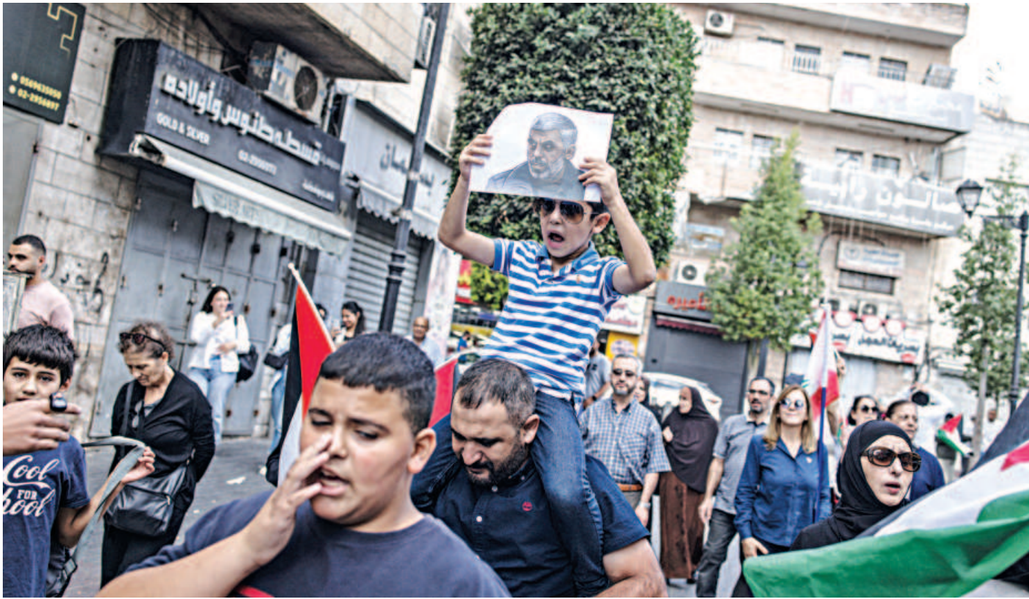
A young Palestinian boy holds up a portrait of slain Hamas leader Yahya Sinwar during a rally in Ramallah, in the Occupied-West Bank yesterday.

"My own word of advice to the incoming government would be that the first business of the cabinet should be to pass a resolution asking for statehood to be restored to Jammu and Kashmir and chief minister should travel to Delhi with that resolution, call on the senior leadership of the country and ask them to fulfil their promise," he said.