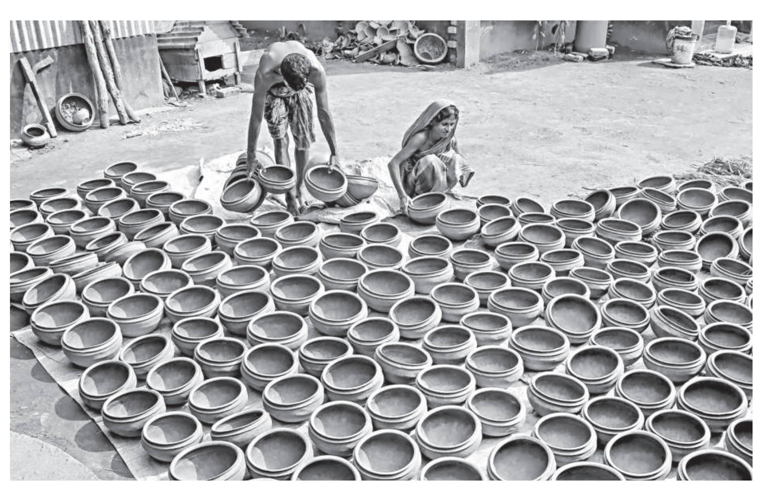
Potters lay out freshly-made clay pots in the sun to dry. They make various items for daily use with clay and sell them for Tk 10-120 per piece. The photo was taken from the Silimpur area in Khulna's Dighalia upazila yesterday.