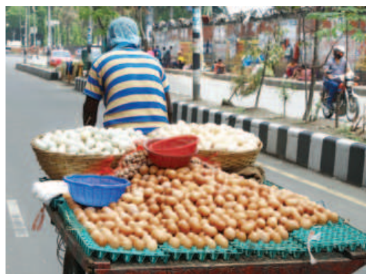
The move is designed to bring down prices of edible oil, sugar and eggs in the domestic market.

In another development yesterday, a senior commerce ministry official said they were considering allowing