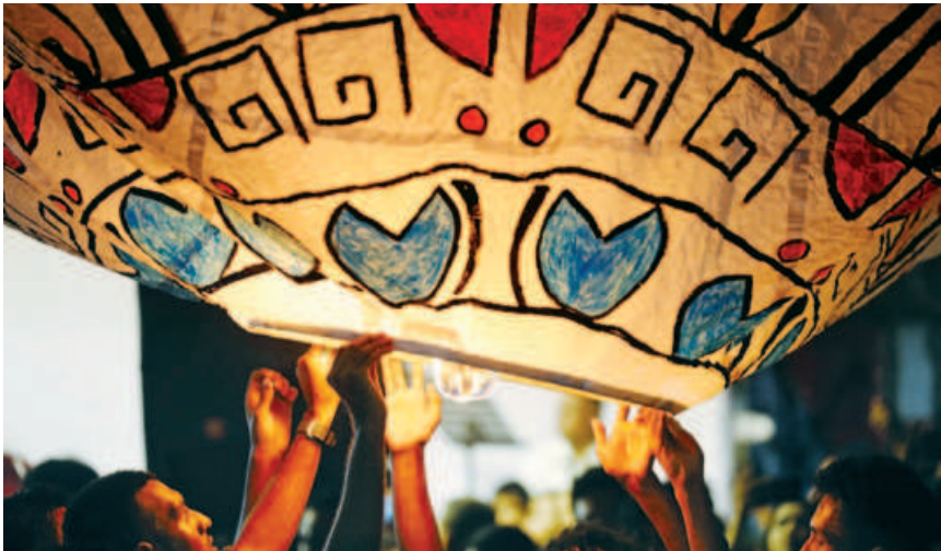
Devotees light up a sky lantern on the occasion of Prabarana Purnima, one of the biggest religious festivals of Buddhists yesterday. The photo was taken on the premises of the Chattogram Buddhist Monastery in the port city’s Nandan Kanon area.