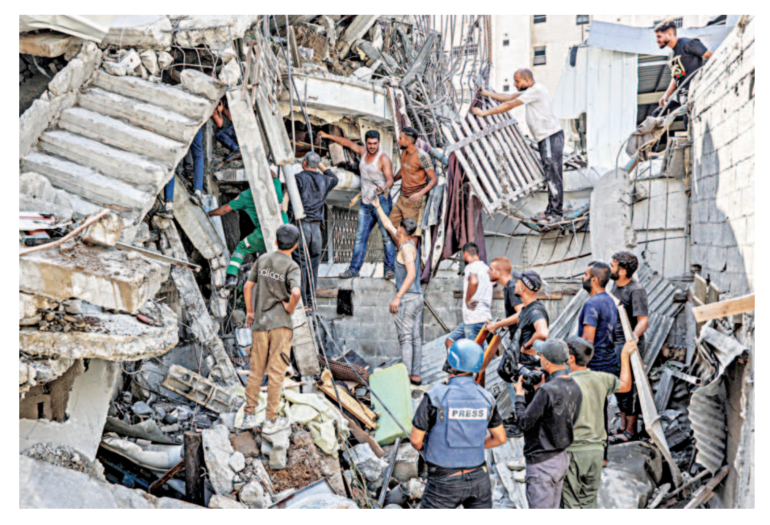
People gather outside a collapsed building as they attempt to extricate a man from underneath the rubble following Israeli bombardment in the Saftawi district of Jabalia in the northern Gaza Strip yesterday.

Chinese Premier Li Qiang is already in Pakistan, while seven more prime ministers of other member and observer states, including Russia's Mikhail Mishustin, were also due to participate in person.