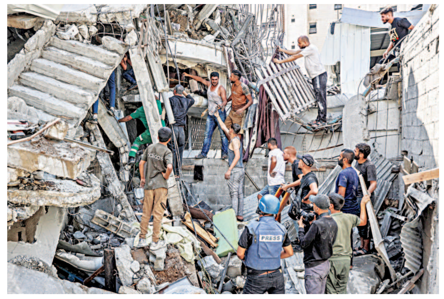
People gather outside a collapsed building as they attempt to extricate a man from underneath the rubble following Israeli bombardment in the Saftawi district of Jabalia in the northern Gaza Strip yesterday.