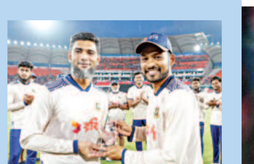
India captain Suryakumar Yadav hugs Sanju Samson after the latter was dismissed following a 47-ball 111 in the third T20I against Bangladesh at the Rajiv Gandhi International Stadium in Hyderabad yesterday. (Inset) Bangladesh veteran Mahmudullah Riyad receives a crest from skipper Najmul Hossain Shanto prior to his last international match in this format.