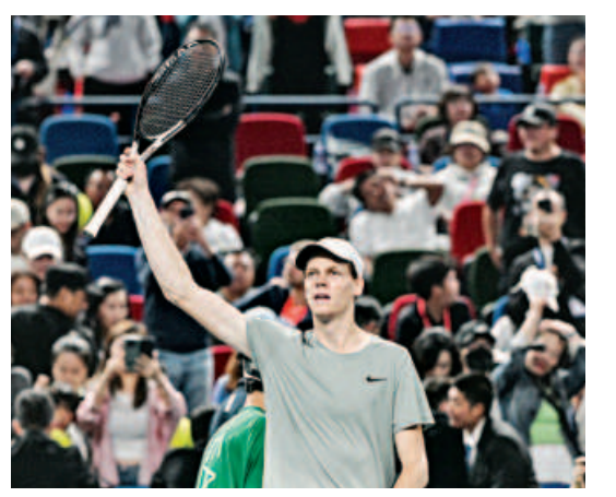
Jannik Sinner beat Tomas Machac 6-4, 7-5 to reach the Shanghai Masters final on Saturday and ensure he finishes the year as world number one. The Italian will face Novak Djokovic -- a four-time Shanghai champion -- in the final on Sunday. The 23-year-old has been in top spot since June and after his ruthless semi-final victory will stay there until at least the end of the season, the first Italian to do so.