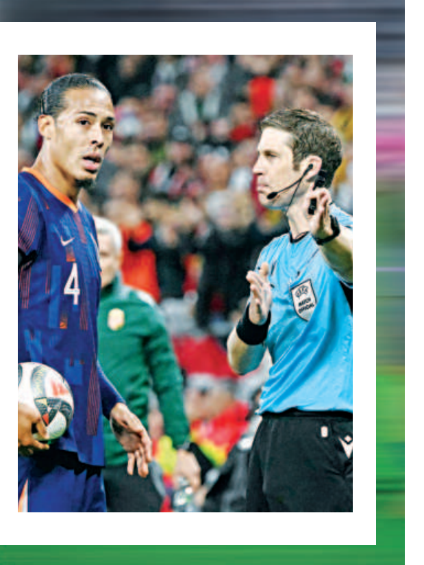
While Germany were boosted by a first-half brace from Deniz Undav in their 2-1 win against Bosnia and Herzegovina in Zenica on Friday, the Netherlands were pegged back by the sending off of skipper Virgil van Dijk (L) during their 1-1 draw in the Nations League. Florian Wirtz laid on a backheel for Undav's opener in the 30th minute before the Stuttgart forward made it two just six minutes later. The Netherlands will next go to Germany, who now remain one win away from the Nations League quarters, without their captain in a game that could see the Dutch rise to the top of the pool, or conversely, be cut five points adrift with two games to play.