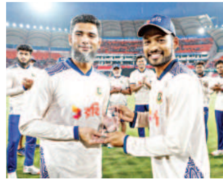
India captain Suryakumar Yadav hugs Sanju Samson after the latter was dismissed following a 47-ball 111 in the third T20I against Bangladesh at the Rajiv Gandhi International Stadium in Hyderabad yesterday. (Inset) Bangladesh veteran Mahmudullah Riyad receives a crest from skipper Najmul Hossain Shanto prior to his last international match in this format.

With 22 sixes and 25 fours, India broke the record for most runs (232) scored from boundaries in a T20I innings.