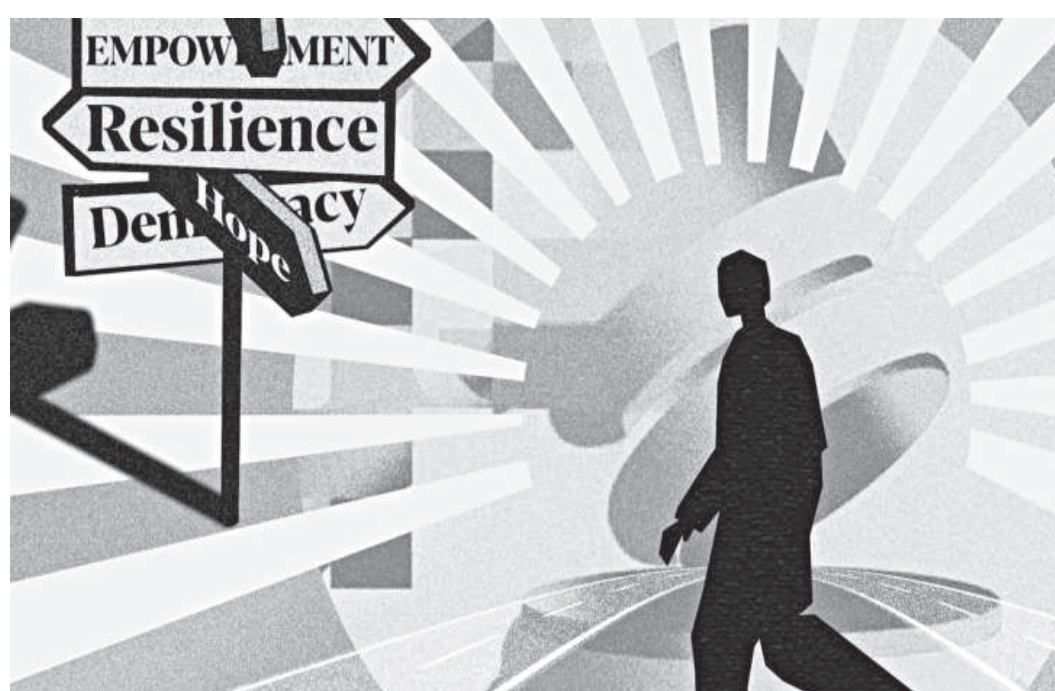
VISUAL: ANWAR SOHEL

senior correspondent based in the Singapore bureau of TIME, and the former China Bureau Chief. The narrative of the article is full of speculative and biased conjectures. I only read it because of the eyebrow-raising title and the fear it was bound to arouse. My biggest concern