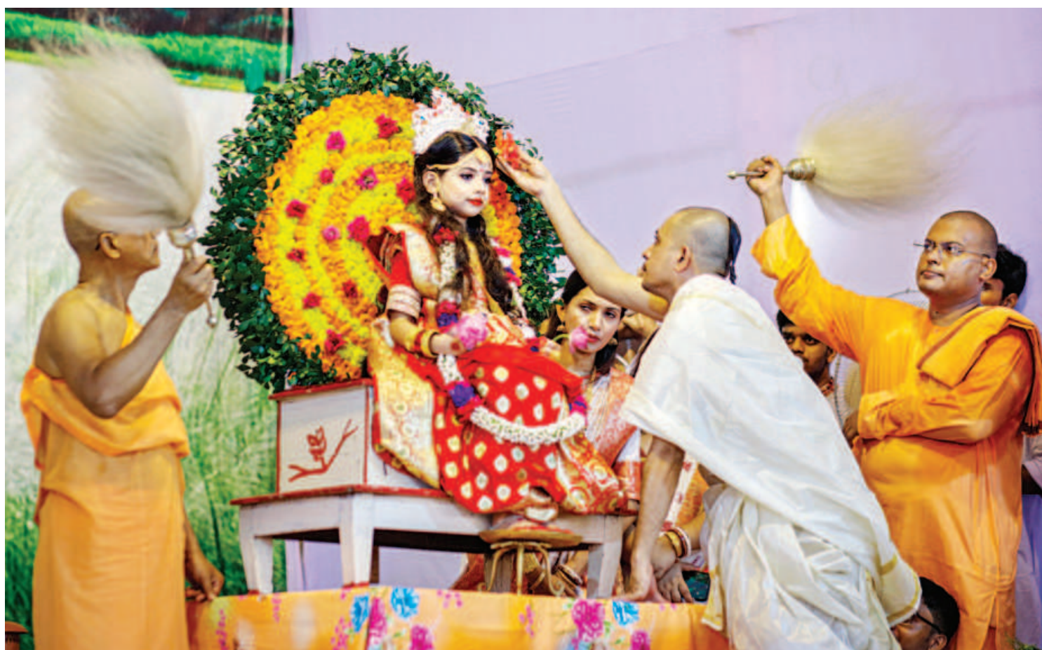
A priest performs the rituals of Kumari Puja at Ramakrishna Math and Mission in the capital's Gopibagh yesterday on Maha Ashtami of Durga Puja, the largest religious festival of the Hindus. Kumari Puja involves the worship of a prepubescent girl as the living embodiment of the goddess Durga.