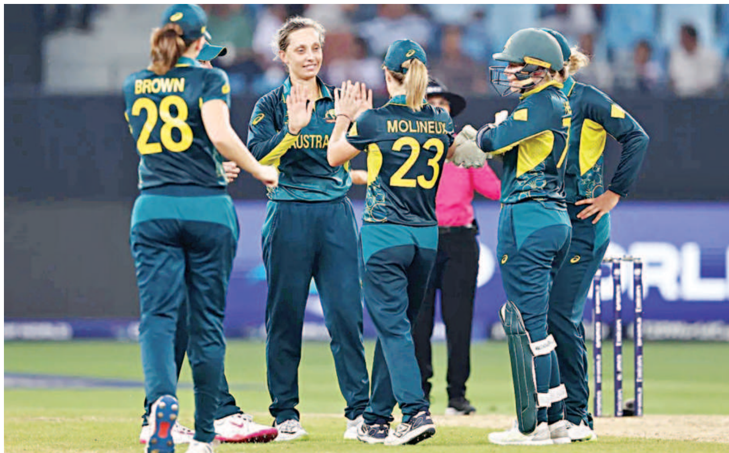
Australia off-spinner Ashleigh Gardner celebrates with teammates after one of her four wickets which helped dismiss Pakistan for 82 in their Women's T20 World Cup fixture in Dubai yesterday. The defending champions chased down the target with nine wickets in hand and nine overs to spare.