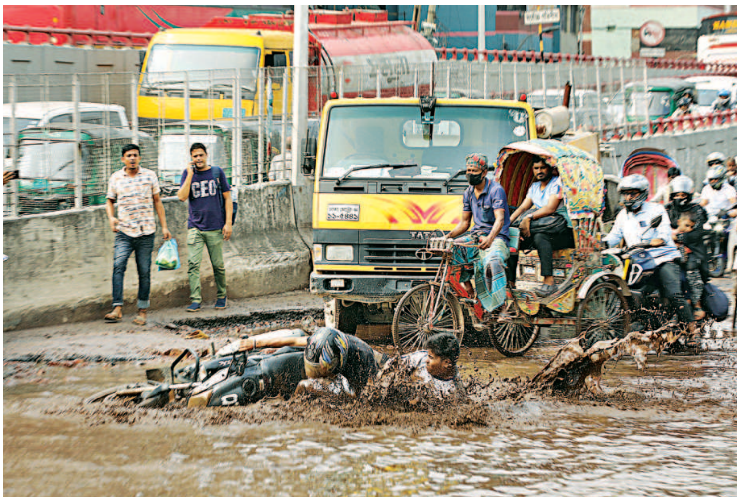
Two bikers fall into a large pothole obscured by logged rainwater in the capital's Dakshin Jatrabari yesterday. Commuters in different parts of the city suffer due to poor drainage and a lack of road maintenance.