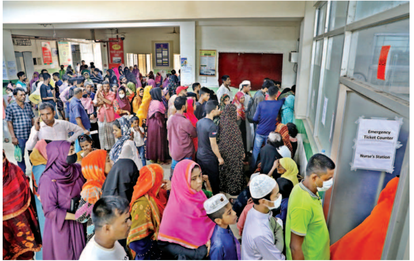
People stand in queues to buy tickets for medical consultations at the capital's Mugda Medical College Hospital yesterday. Hospital staffers say the number of patients suffering from dengue, cold, cough and breathing problems has shot up recently. As of yesterday, dengue has claimed at least 199 lives nationwide this year.