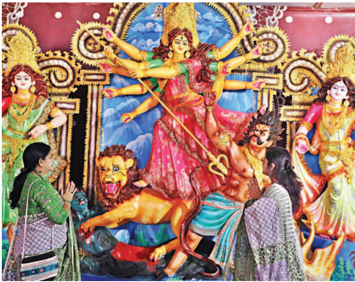
Two devotees praying to Goddess Durga at the Ramna Kali Temple on the sixth day of the Durga Puja festival (Shashthi) yesterday.

The junta has suffered serious battlefield defeats over the past year during a renewed offensive by ethnic minority armed groups and pro-democracy "People's Defence Forces" that rose up to oppose its coup.