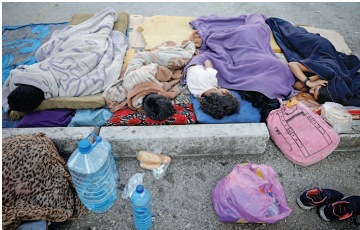
Displaced Lebanese children sleep at a parking lot in Beirut yesterday amid ongoing hostilities between Hezbollah and Israel.