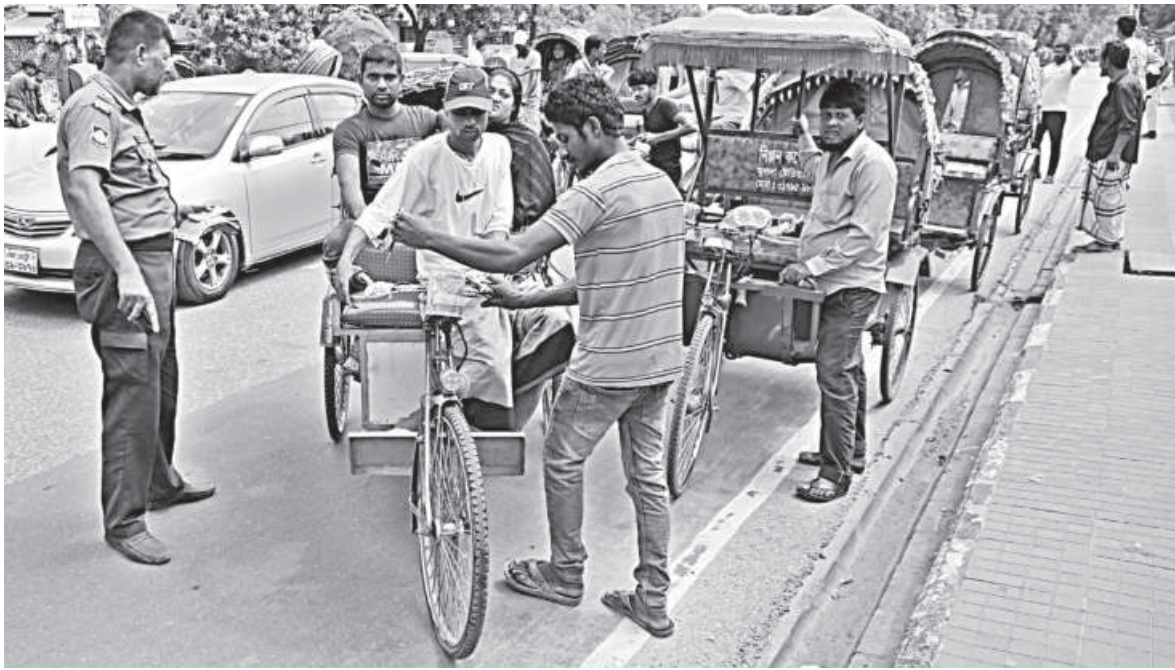
As part of its ongoing drive, police seize battery-run auto-rickshaws in Dhaka's Mohammadpur area, as they are banned on the capital's major streets. Authorities say these vehicles lack proper speed control and frequently cause accidents. Despite repeated warnings, they continue to operate on restricted roads. The photo was taken yesterday.