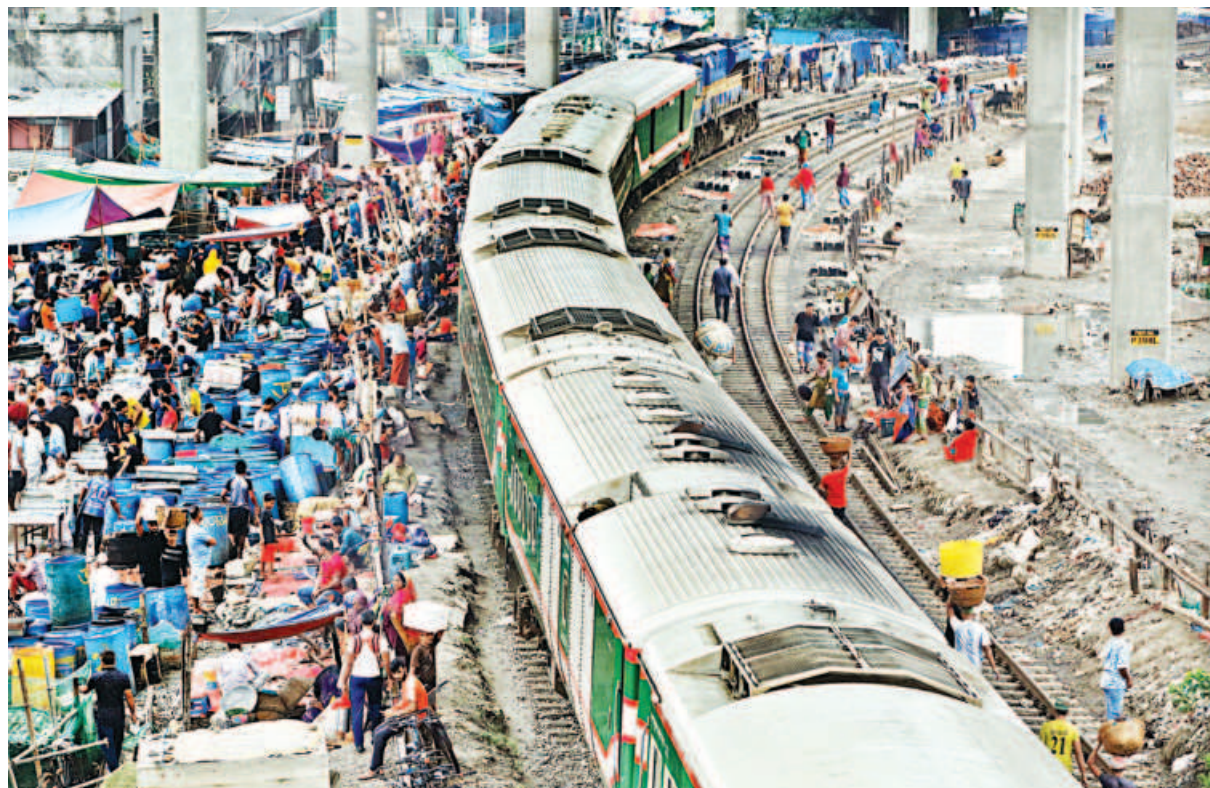
A bustling kitchen market on the rail lines in the capital's Karwan Bazar. While this a blatant disregard for safety, food hygiene is also compromised because of the close proximity to moving trains. The photo was taken yesterday morning.