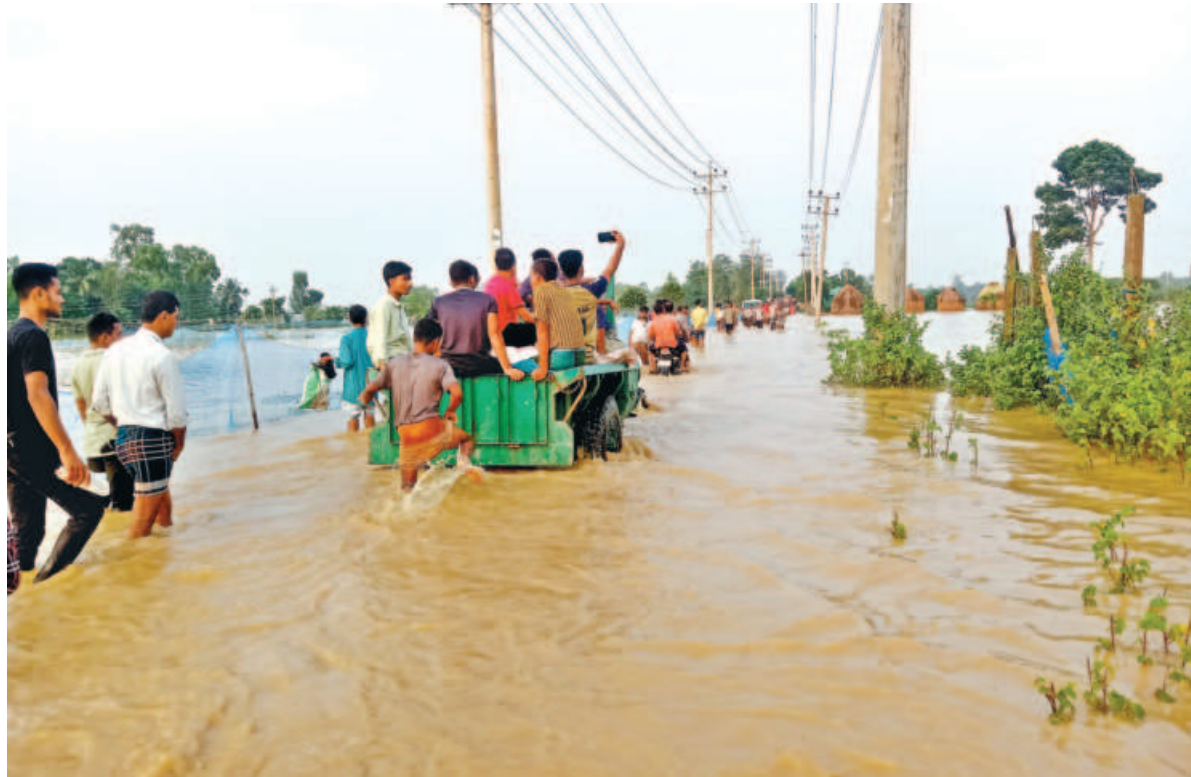
People travel on a tractor trailer while others walk on a flooded road in Nalitabari, Sherpur. Some areas in the district have become completely inaccessible by roads as swollen rivers in the region continue to inundate villages and upend lives.