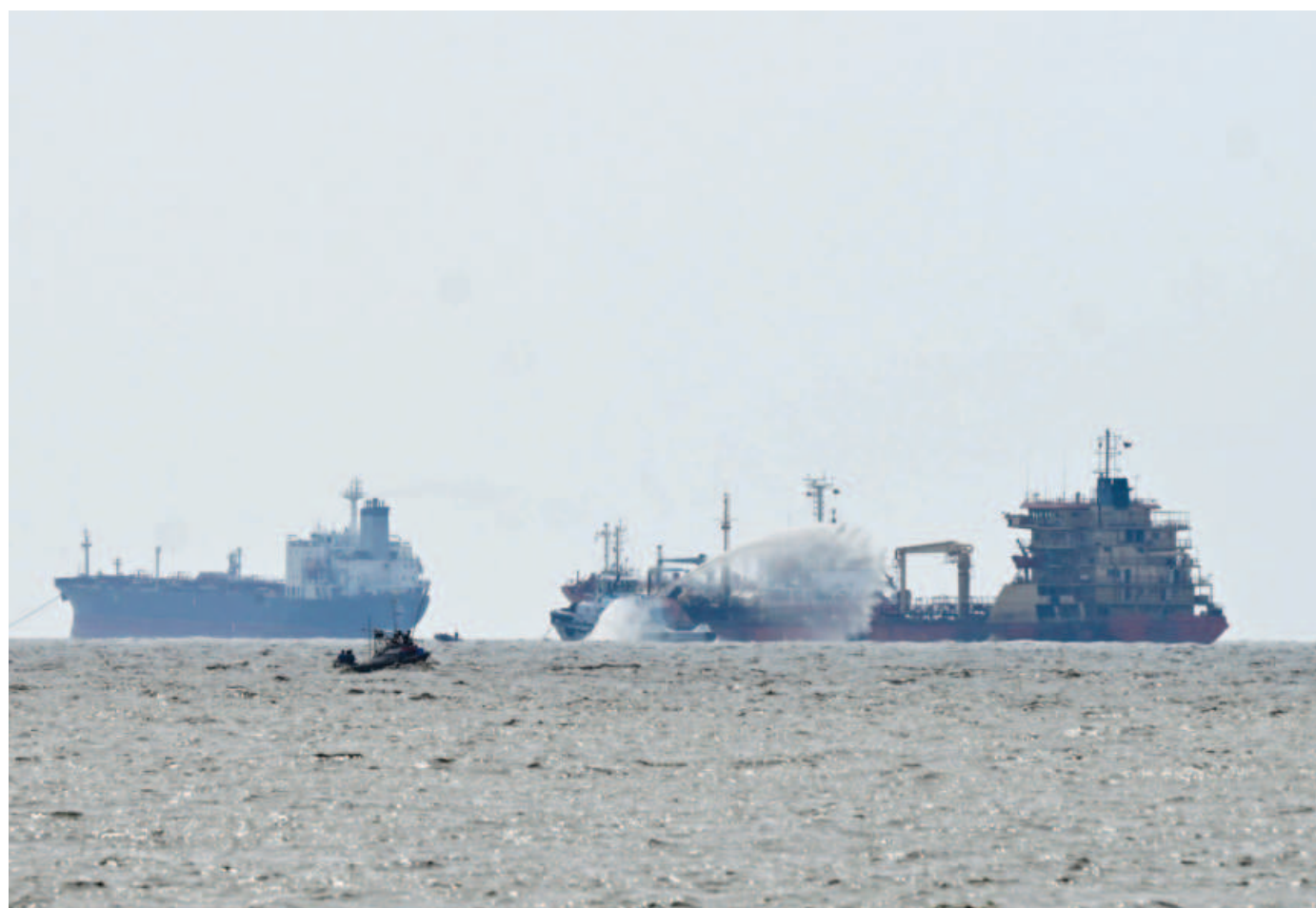
Fireboats working to douse the blaze on oil tanker "Banglar Shourabh" that caught fire at the outer anchorage of Chattogram Port early yesterday. This is the second fire incident on a tanker owned by Bangladesh Shipping Corporation in a week.