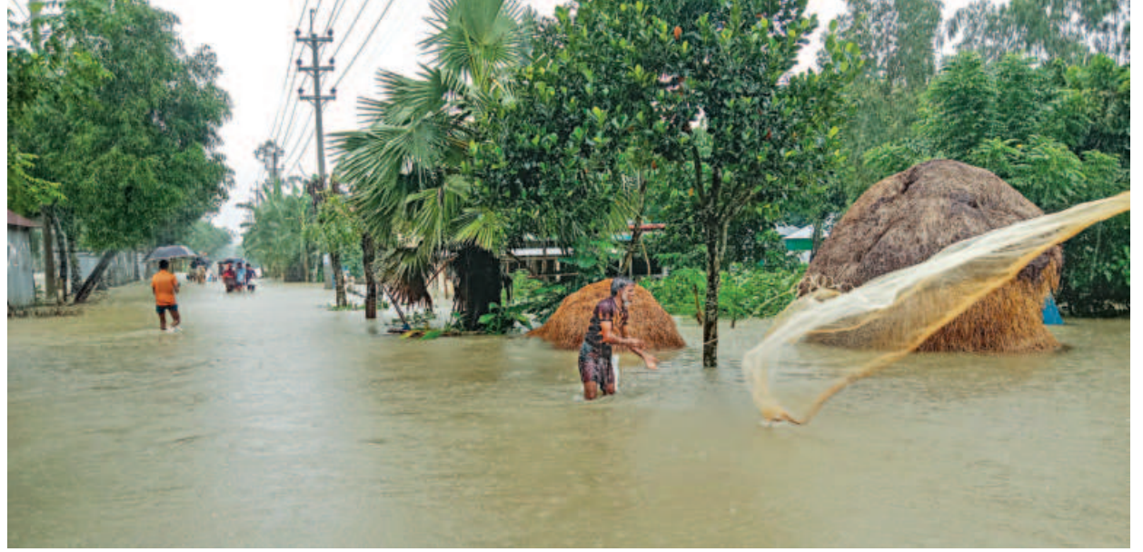
Amid rising floodwaters, a fisherman throws a net on the submerged Sadar-Nalitabari road hoping to catch fish that have been swept away from nearby waterbodies. The photo was taken in the Gollapara area of Sherpur Sadar upazila around 9:00am yesterday.

It is worrying that people who are being arrested on specific charges like corruption and murders are being released on bail, he said, adding