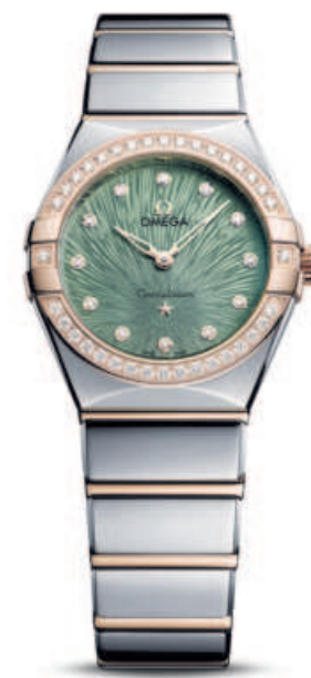
CONSTELLATION 28 MM