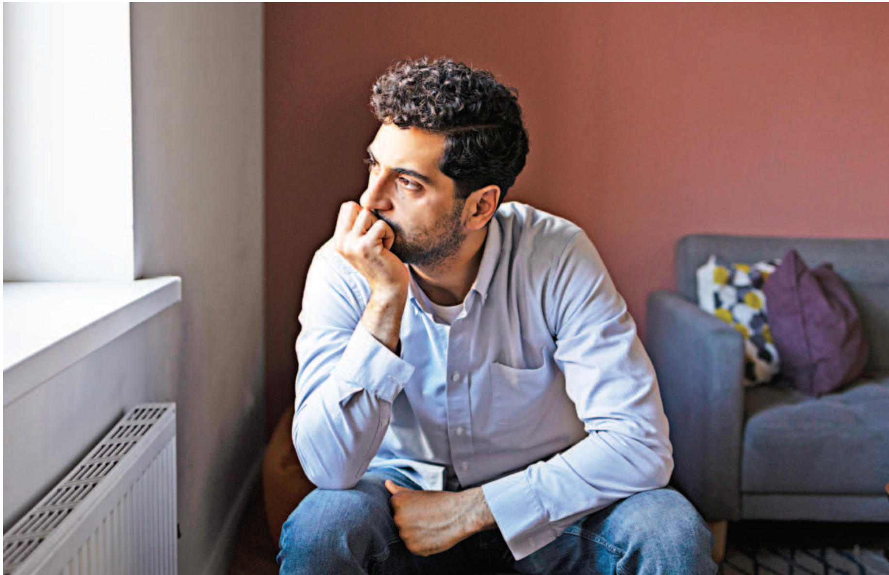
A man pictured with all the friends he thought the iPhone 16 would help him make.