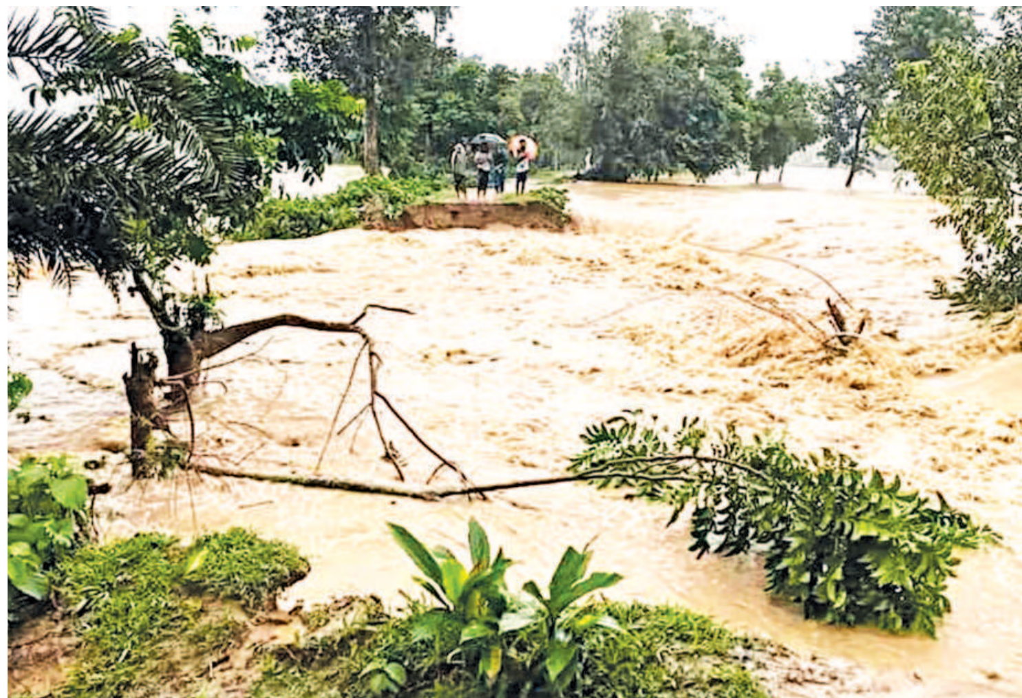
Floodwater gushes in through a breach in an embankment along the Moharashi river in Khoikora area of Sherpur's Jhenaigati upazila. Heavy rain and runoff from upstream inundated a vast swathe of land in the upazila yesterday.