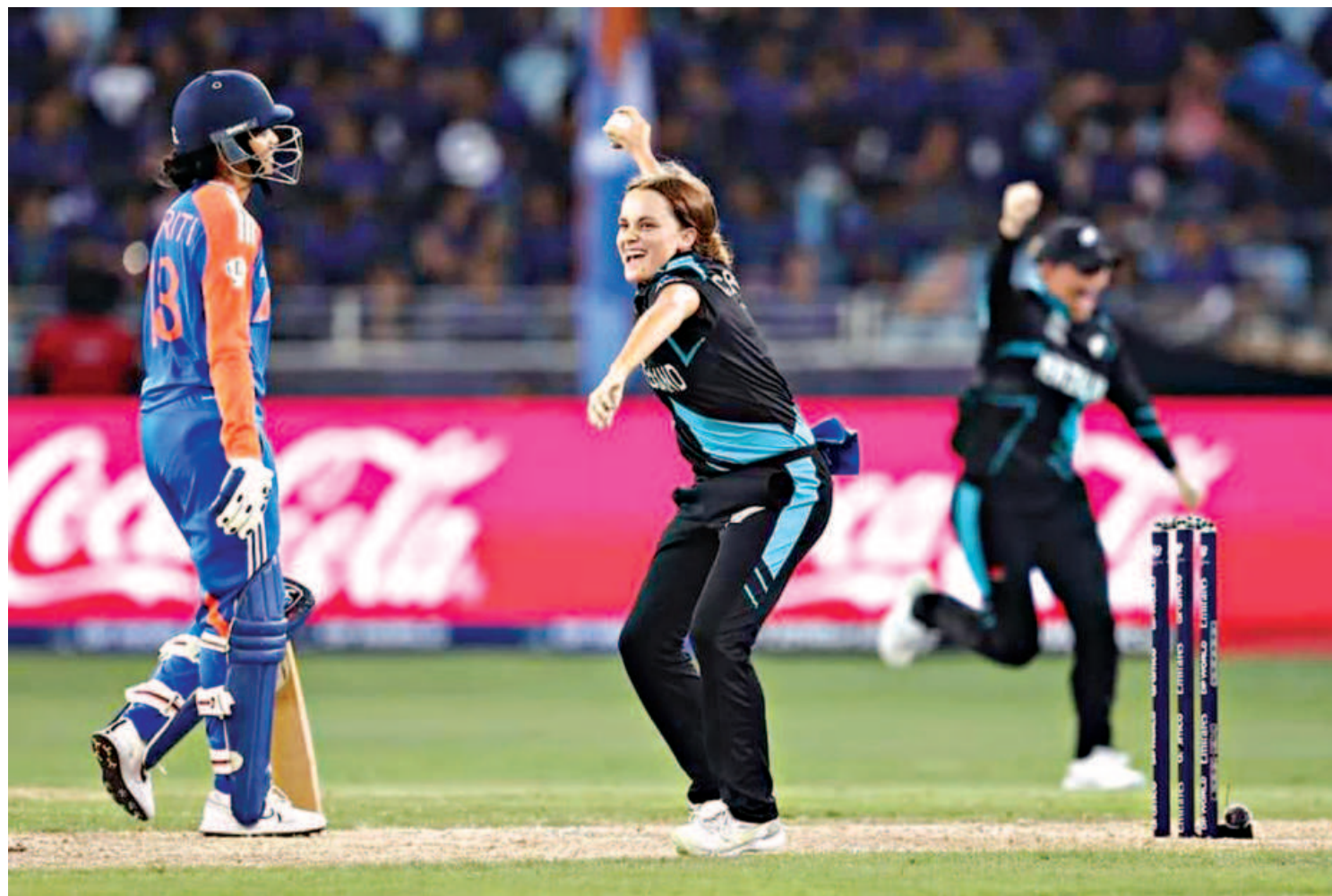
New Zealand off-spinner Eden Carson celebrates the dismissal of India opener Smriti Mandhana – one of her two wickets – during their 58-run victory in a Group A match of the Women's T20 World Cup in Dubai yesterday. Earlier in the day, South Africa beat West Indies by 10 wickets in a Group B fixture.