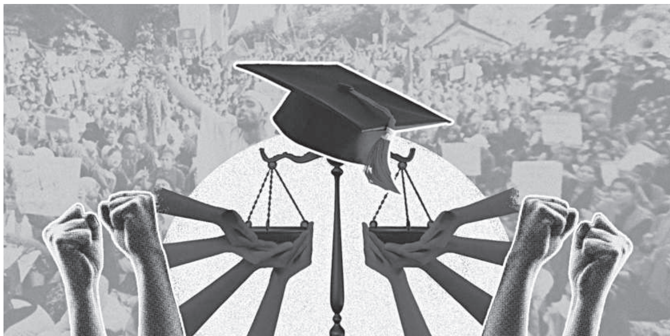
VISUAL: SHAIKH SULTANA JAHAN BADDON

have historically used both religion and Bangalee nationalism to serve various political purposes, creating a complex interplay between identity and power. The push for a homeland for Bangalee Muslims during the Partition proved to be short-lived, as it became clear that our cultural identity was fundamentally different from those in Pakistan. Following the independence of Bangladesh in 1971, the focus shifted towards language and