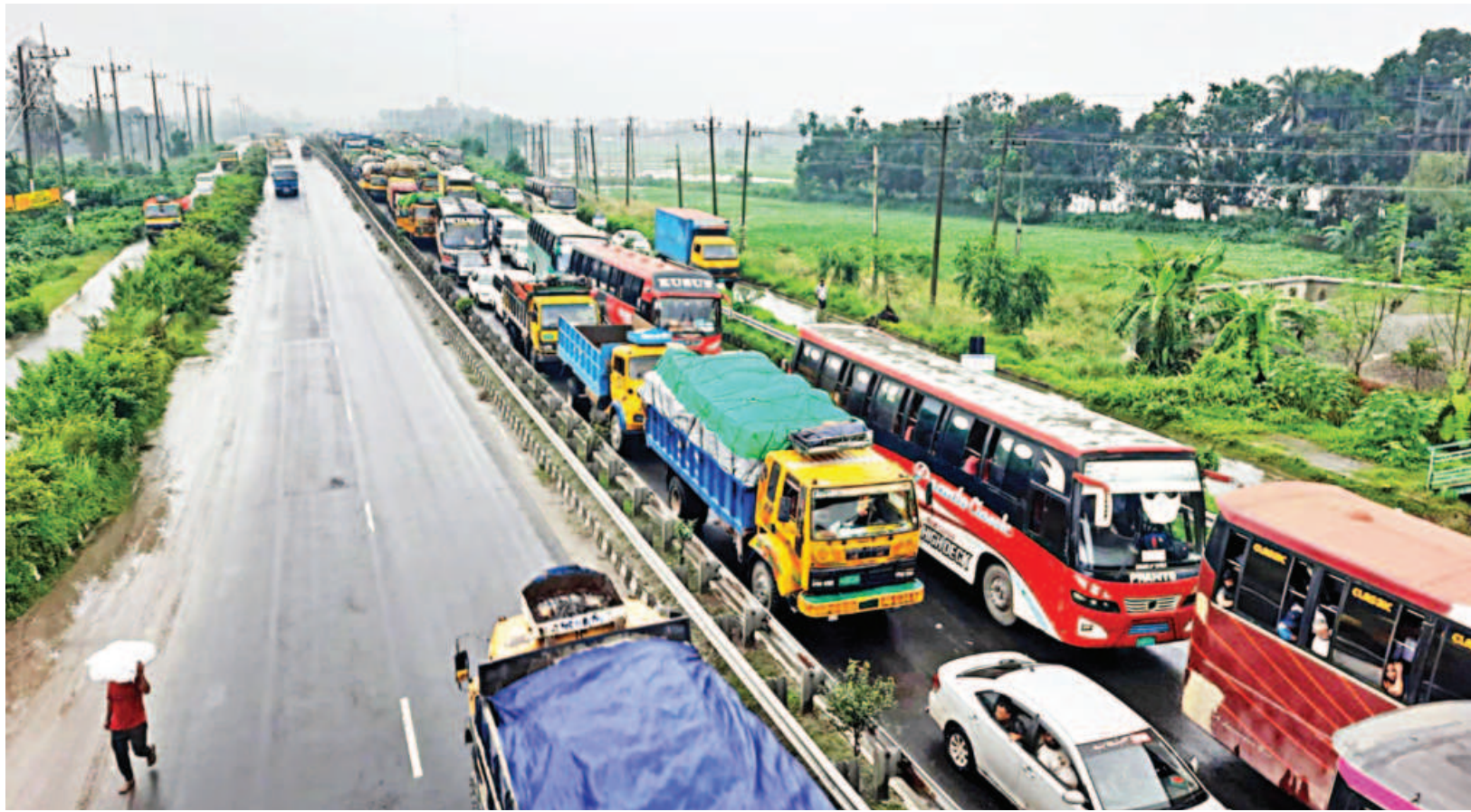
Vehicles leaving Dhaka for the northern districts are stuck in a 25km gridlock from the eastern end of Bangabandhu Bridge to the bypass road in Tangail town. Highway police said the jam was created due to heavy flow of traffic, incessant rains, and reckless driving. The photo was taken at Rasulpur in Tangail Sadar upazila around 4:00pm yesterday.